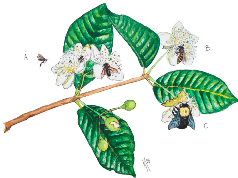
Figure 1. Illustration of guava flowers at different stages (bud, cracked bud and open flower) and the most important pollinators: (A) Three species of stingless bee, from left; Heterogona itama , Tetragonula laeviceps and Geniotrigona thoracica . (B) Asian honey bee Apis cerana . (C) Carpenter bee Xylocopa (Koptortosoma) aestuans .