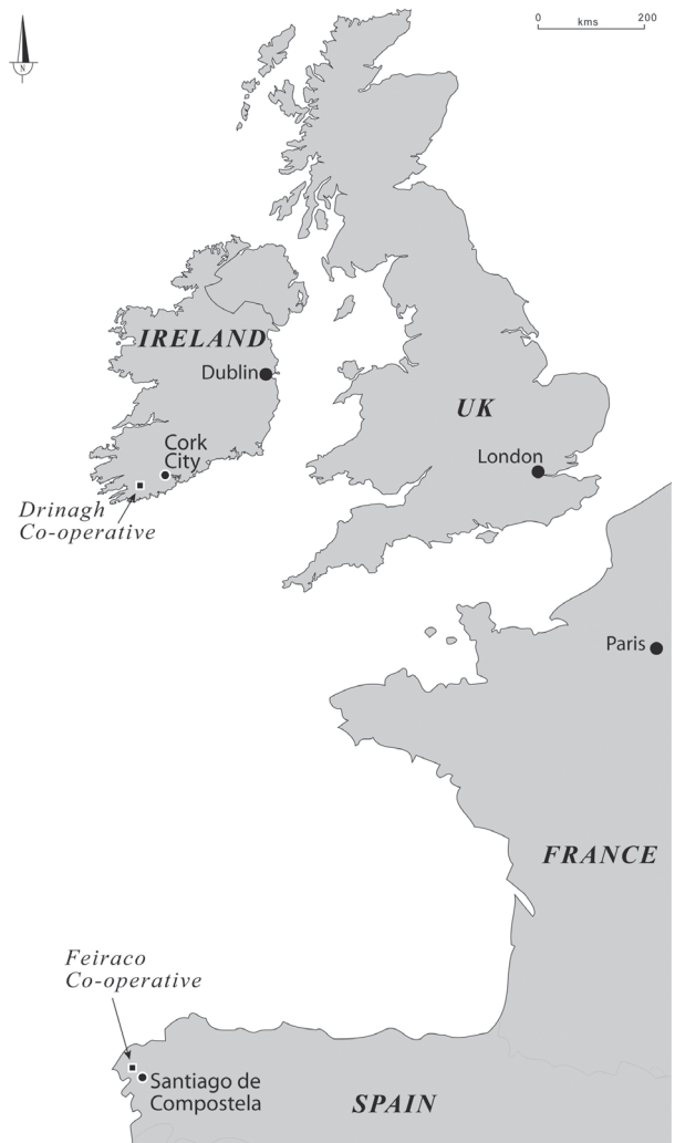
Figure 1: Location of Drinagh and Feiraco Localisation de Drinagh (Irlande) et de Feiraco en Galice (Espagne)

Also, in the Irish case, demographic pressure on the land was remarkably reduced by the mass exodus of rural population to the United States and Britain, due to the potato blight and its impact on food security from the mid 1800s. In West County Cork, the development of capitalist dairy farming was promoted and family farms abandoned their traditional practices in favour of a market approach and increased profits. Ireland's joining the European Economic Community in 1973 was a catalyst to promote modernizing and capitalist family farming practices over the entire island. Spain, delayed membership of the EEC until 1986: this is one of the main reasons that family farming systems have