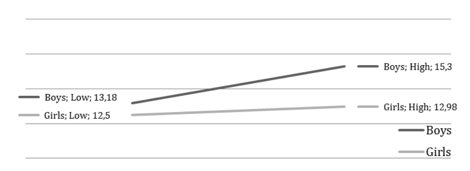
Figure 3. Means in perceived emotional repair by gender and levels of perceived emotional attention.