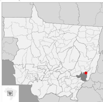
Figure 1. Geographic location of the state, city and study site.

Data was collected in the crop fields of Embrapa in partnership with Agropecuária Fazenda Brasil, in Barra-do-Garças City (MT), at coordinates 14° 59'25.34"S and 52°16'21.05". The city is located in Southeastern Mato Grosso State (Figure 1), in a transition area between the Amazon and Cerrado biomes (MARACAHIPES et al. , 2011). Tropical Savanna (Aw) is the local climate, with two well-defined seasons: dry (May to September) and rainy (October to April) (SOUZA et al. , 2013).