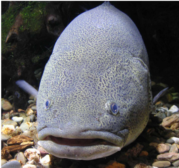
Figure 1: The iconic Murray cod.

Keywords: Murray cod; long reads; genome; transcriptome; hybrid assembly