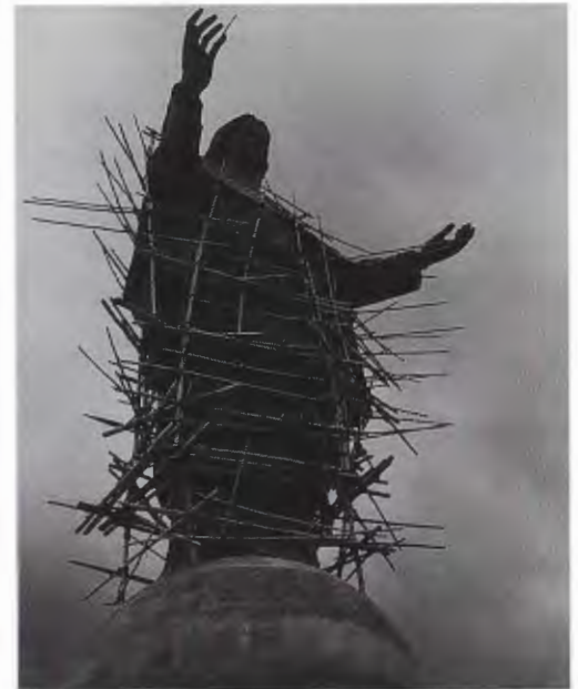
The statue of Christ the King looking out over Fatukama Bay is intended to show recognition of East Timor's Christian identity. But with no sign of official respect for the aspirations of the East Timorese, it may become just another symbol of Indonesian dominance. See page 8 for story.

The occupations at the Dutch and Russian embassies marked a new departure: the East Timorese were accompanied by a number of Indonesian supporters from relatively new organisations such as Solidaritas Mahasiswa Indonesia untuk Demokrasi (SMID – Solidarity of Indonesian Students for Democracy), Solidaritas Perjuangan Rakyat Indonesia untuk Maubere (SPRIM – Indonesians in Solidarity with the Maubere People), and the Centre for Indonesian Workers' Struggle (PPBI). These groups together constitute an umbrella movement known as Persatuan Rakyat Demokratik, or Democratic People's Alliance, formed in May 1994. Knowledge of and support for East Timor's plight have been growing steadily among democrats in Indonesia, who link many of their own democratic aims with the search for self-determination for East Timor. This was their first high-profile demonstration of solidarity. The courage of the Indonesian activists is remarkable given that they would not have been able to secure asylum, in Portugal or elsewhere. One group was forced out of the Dutch embassy after the Indonesian authorities