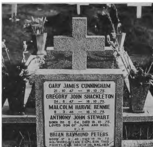
The monument in Jakarta to the five journalists killed in Balibo. It is not known if their remains are buried here.