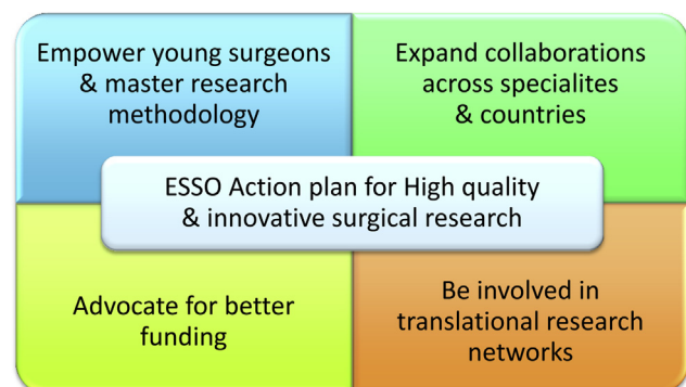
Fig. 2. ESSO's for pillars of action for improving clinical research in surgery.