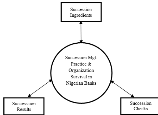
Figure 2. Themes for succession management and organization survival in Nigerian money deposit banks