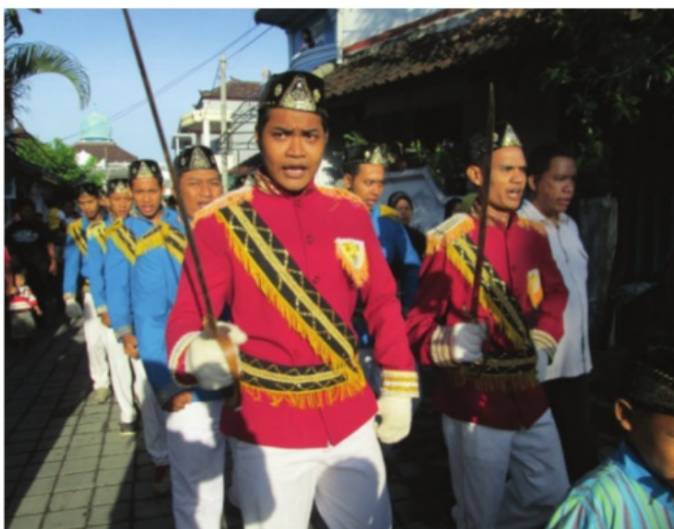
Figure 2. Rodat performing art dancers in Bugis Kapaon Village, Denpasar, Bali, Indonesia.