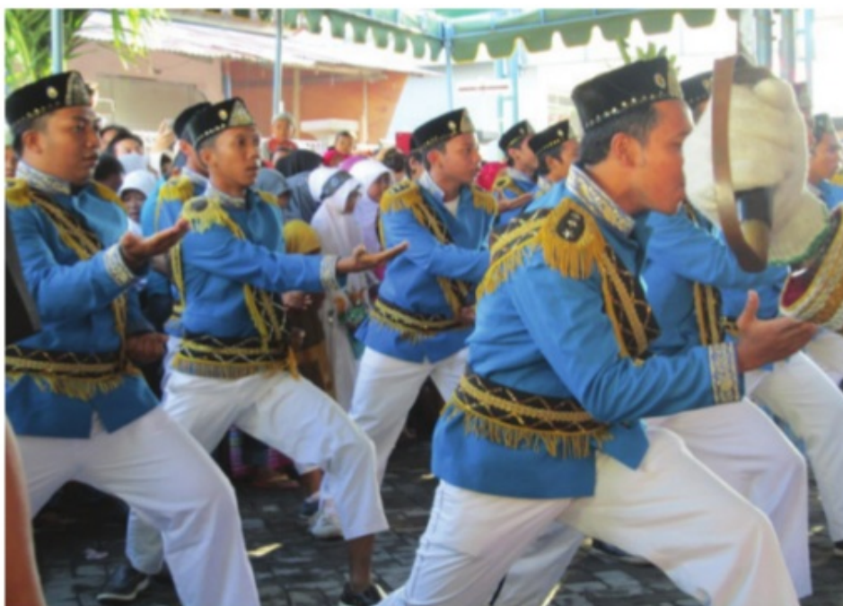
Figure 1. Rodat performing art dancers make a line to go to the stage in Bugis Kapaon Village, Denpasar, Bali, Indonesia.