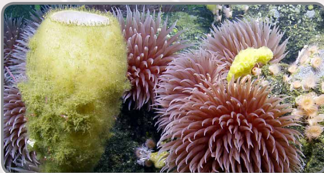
Figure 2. Vibrant pom-pom anemones, Liponema brevicornis , and a large boot glass sponge occupied by shrimps made up this rocky undersea garden.

During Nautilus cruises NA074 (see pages 38–39) and NA075, four previously undiscovered whale falls were found southeast of Santa Rosa Island (90 m depth), on Sixtymile Bank (370 m depth), on Northeast Bank (437 m depth), and on Patton Escarpment (1,094 m depth), all at late stages of decomposition. These are among the shallowest natural whale falls discovered worldwide thus far. The Santa Rosa skeleton is small compared to the other falls and lies in well-oxygenated water, while the others are located within oxygen minimum zones (10–25 \mu\text{M} ). The Sixtymile Bank skeleton is that of a mysticete, but its species cannot be determined without a DNA sample from one of the bones. This skeleton was mostly intact, un-sedimented, and undegraded, with many bones still in place (Figure 4). The carcass on Northeast Bank was highly degraded and covered with a lot of sediment, and thus may have been on the seafloor for years to decades. Furthermore, several animals were using the bones as hard substrate and for shelter. On the Patton Escarpment whale fall, urchins were grazing on the bones that also showed evidence of microbial mats, suggesting there was still energy in the bones despite their degraded state. There was no visible evidence of Osedax or other whale-fall-endemic fauna on any of the carcasses.