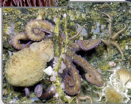
Figure 3. A giant Pacific octopus, Enteroctopus dofleini , camouflages itself among brittle stars, anemones, serpulid tubeworms, and other encrusting species on a rocky outcrop.