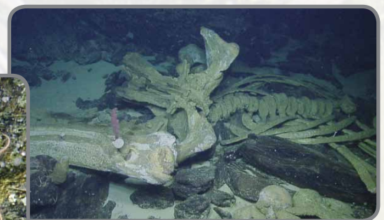
Figure 4. The whale skeleton located among large rocks on Sixtymile Bank was host to several animals, including a coral, a sponge, and sea stars.