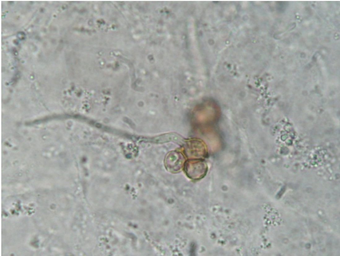
Figure 4 Sclerotic cells with hyphae (10% potassium hydroxide technique).