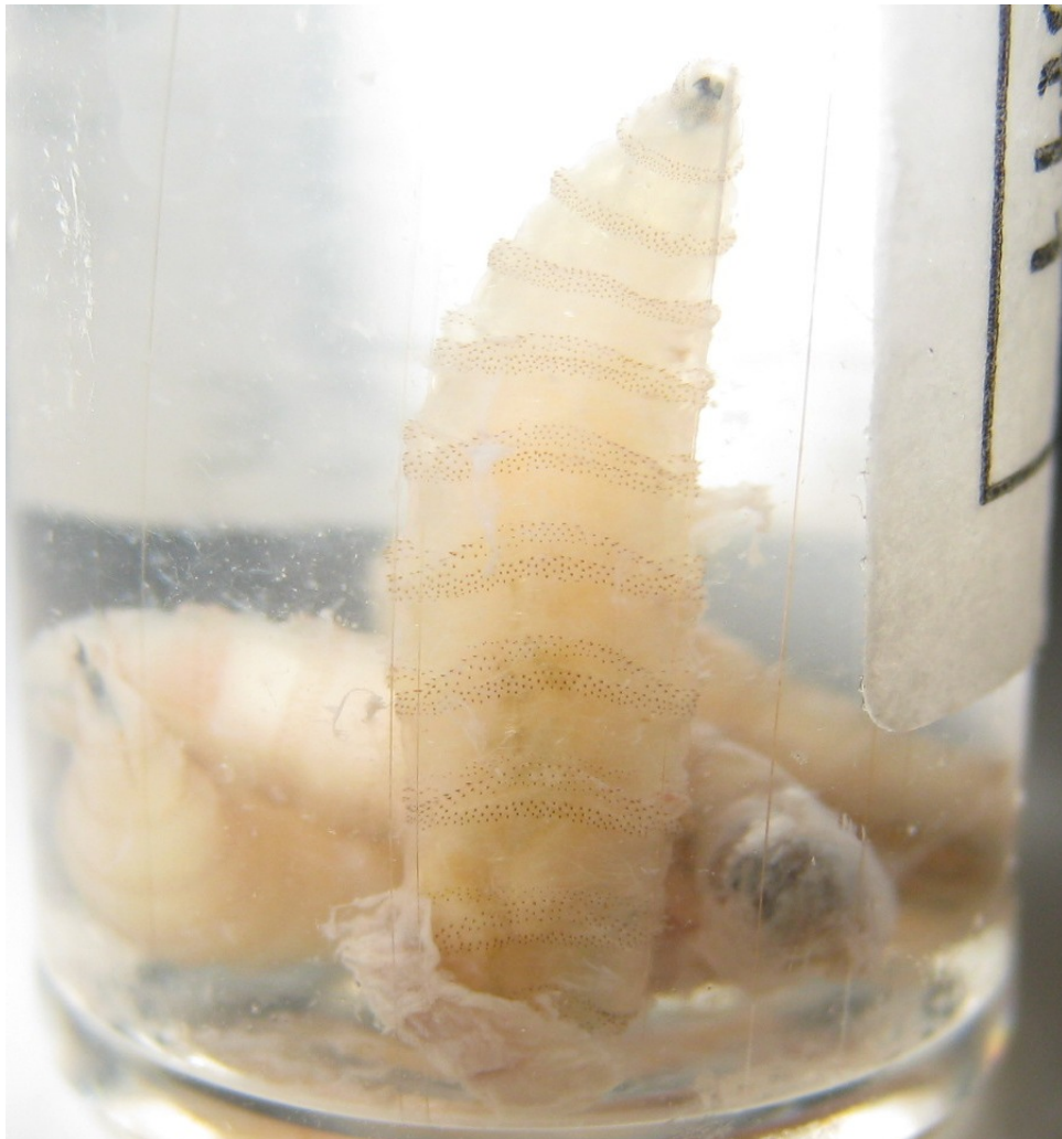
Figure 5 Third instar larvae of Old World screwworm fly, Chrysomya bezziana recovered from the patient's heel with the characteristic bands of black cuticular spines which help to resist extraction.

remained negative in all 3 samples, whereas 18S rRNA-PCR was positive in one of the 3 samples. Subsequent sequencing revealed 100% similarity with Fonsecaea pedrosoi , monophora , and F. nubica . The sequence was published in GenBank (accession number HQ616145).