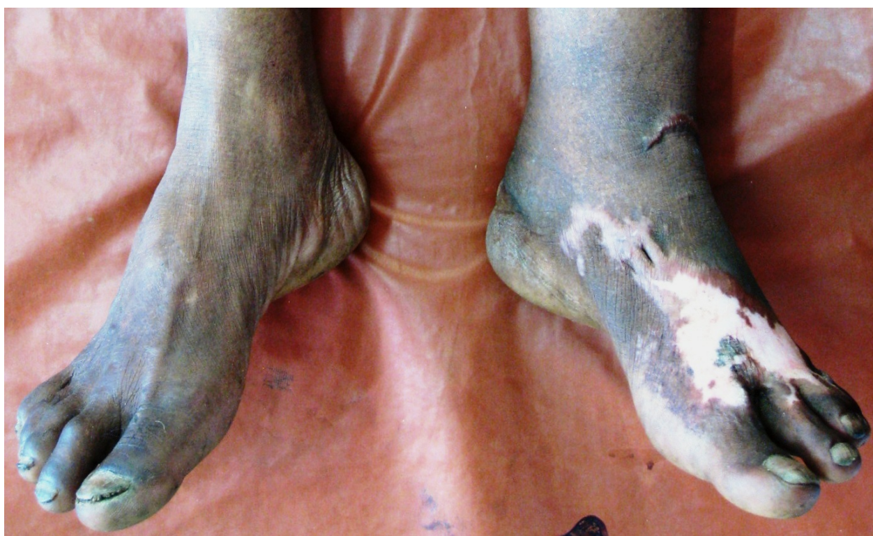
Figure 6 Healed skin lesions 8 months after initiation of antifungal treatment and surgical debridement.

our patient. The gene sequence analysis using 18S primers, in contrast to ITS primers, which have been used for Fonsecaea species identification in pure cultures [14-16], cannot distinguish between Fonsecaea pedrosoi , F. monophora and F. nubica [17]. The finding that only one sample was positive with 18S primers might be due to a very low fungal load or an alteration during the sample processing and transport from remote northern Laos. PCR with 18S primers may have a higher sensitivity for the detection of Fonsecaea spp. from biopsy material compared to ITS primers, however, PCR diagnosis of Fonsecaea spp. is not yet standardized.