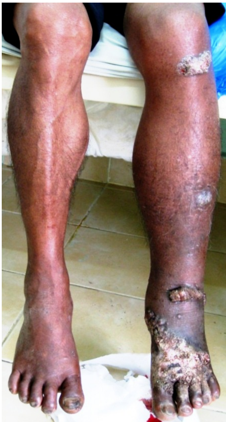
Figure 1 Lower legs of the patient at presentation with typical lesions on his left foot that spread centripetally up to his knee.

identified as third instar larvae of the Old World screw-worm fly, Chrysomya bezziana (Diptera: Calliphoridae) [8]. Due to the pathognomonic microscopic findings of sclerotic cells he was diagnosed with chromoblastomycosis and started on itraconazole 400 mg/d monthly