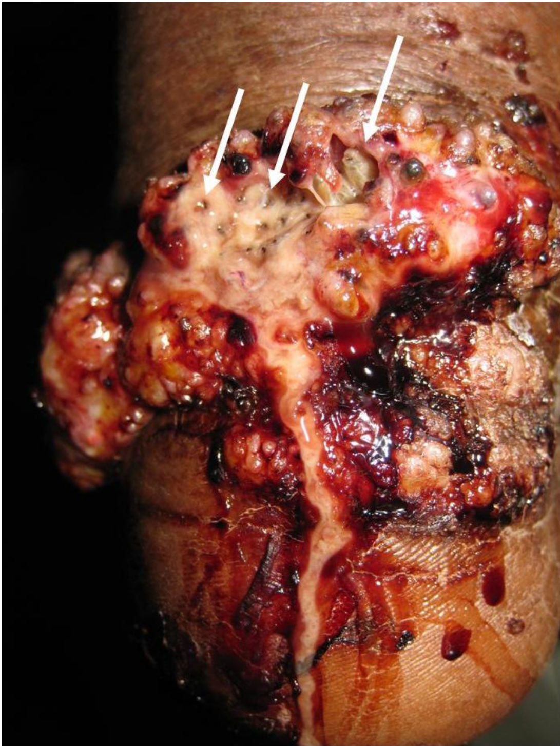
Figure 2 Patient's heel with groups of deeply burrowed larvae and their black caudal ends.

tissue. DNA extraction was performed from each of three tissue samples of about 3 mm in diameter from the patient's lower leg. Fungal DNA was amplified with two different PCR-protocols, using primers of the internal transcribed spacer (ITS) 1 and 4 region [9,10] and