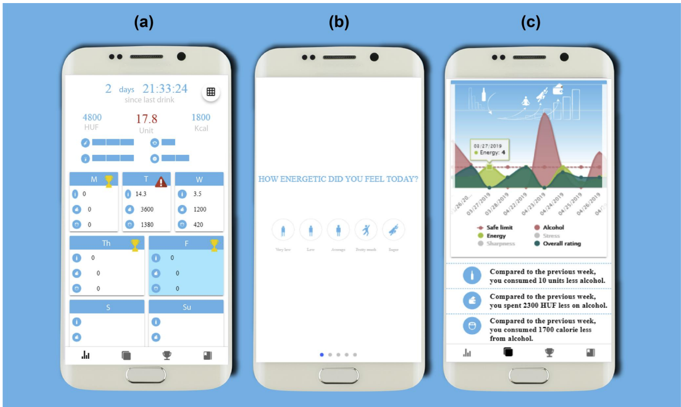
FIGURE 3 Screenshots of the application: (a) data entry, (b) state/mood diary data entry, and (c) feedback of the tracked moods and alcohol consumption (translated from Hungarian to English for publication purposes only)

Miller, Smith, & Tonigan, 2002). Online support groups also offer peer support, motivation, and positive role-modeling (Moos, 2007). Based on Urbanoski, van Mierlo, and Cunningham (2016), relatively low activity is expected from most members but having an option for social networking might be a potential way to reduce attrition (Bennett & Glasgow, 2009). Community chat has six chat rooms with different topics: (1) successes, (2) lifestyle, (3), techniques (4), urgent (about to slip), (5) relapse, and (6) free. The rationale behind divide the chat into topics was to facilitate goal-oriented communication between users.