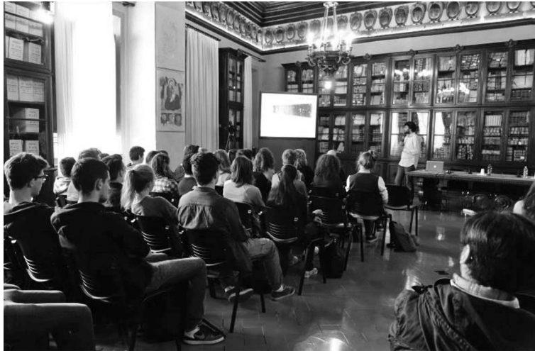
Fig. 4. – Public lecture in the Sala Azzurra (Blue Room) of the SNS.

of educational movies with non-technical language, that can be enjoyed by the general public interested in the subject, by school students who use them as a guidance for their university choice, and by university students who are looking for in-depth information on a specific topic. We have also created a substantial number of “Science pills”, short movies in which a researcher or professor from the SNS briefly describes in a recent scientific discovery (see fig. 5).