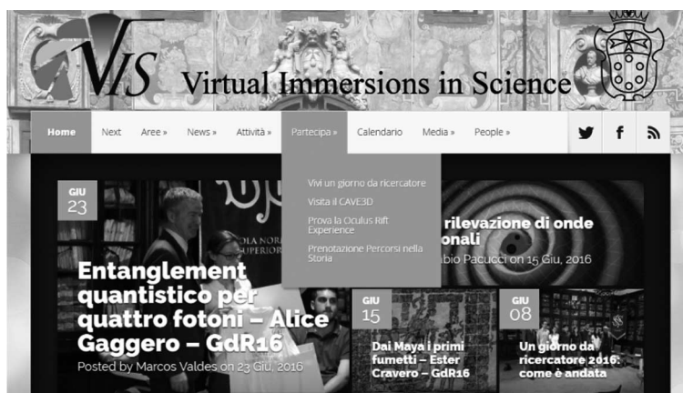
Fig. 6. – Screenshot of the web page http://vis.sns.it .

method) is an experience that leaves its deep mark on a young person who experiences it in a direct and practical way. Scientific dissemination must thus be an active rather than a purely passive (and sometimes tedious) way of learning. For these reasons, all our activities include a great deal of innovation in their method, which can almost be said to be individualized so as to awaken interest present in each one of us.