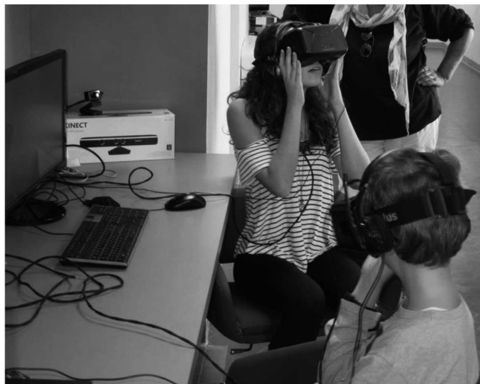
Fig. 2. – Immersions in science via Oculus Rift 2.0.

With VIS we also have five Oculus Rift 2.0 virtual helmets (fig. 2) with their portable workstations that allow us to “transport” the experience of CAVE3D out of the SNS, giving opportunities to many groups and classes of secondary schools from all over Italy to virtually experience the extraordinary adventure of immersion in the most recent scientific data produced at the SNS, under the supervision of graduate students of the SNS.