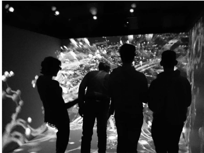
Fig. 1. – Visit to CAVE3D, immersion in a protein.

monuments, but also a place of scientific excellence in which visitors can see the leading research produced at the SNS from a close distance.