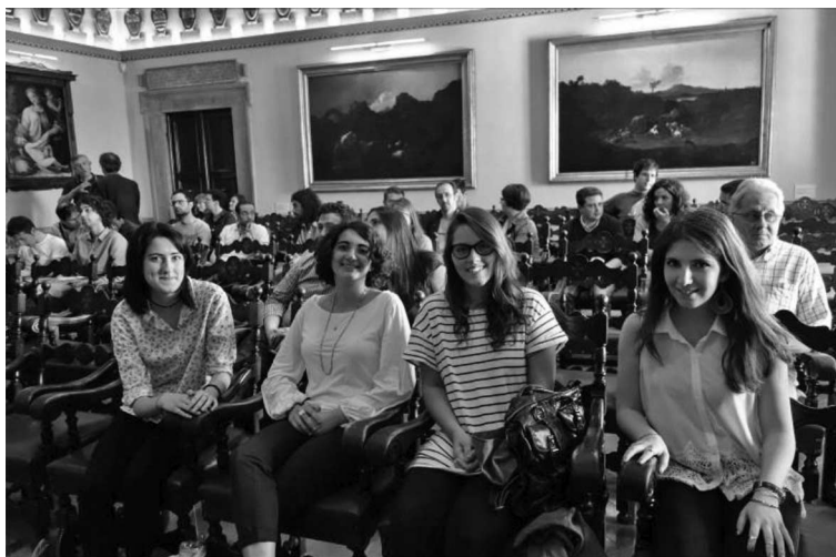
Fig. 3. – The winners of “A day as a researcher” 2015.

2.2. A day as a researcher. – With “A day as a researcher” we select, on the ground of merit, five students from secondary schools from all over Italy in order to give them the unique opportunity to follow step by step one of our researchers or a research group of the SNS, accompanying them for a whole day in their routine work. This represents a concrete way for young people interested in science to directly understand what the profession of researcher means.