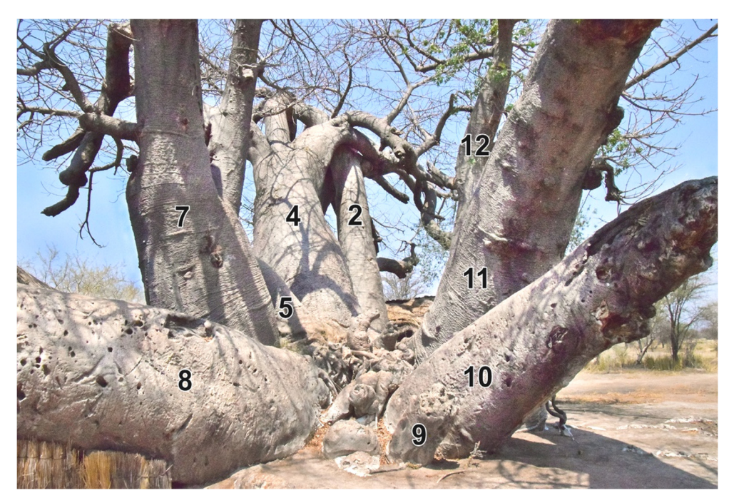
Figure 3. The photograph shows the common area from which the stems, that build the open ring-shaped structure, started growing.

Over time, stems may topple and die, while new stems emerge periodically from roots or from other fallen or broken stems. Such multistemmed and multi-generation baobabs with open RSSs are going through successive cycles of death and rebirth from their remains. In the case of open RSSs, the collapse and death of one or even of several stems does not usually affect the whole ring.