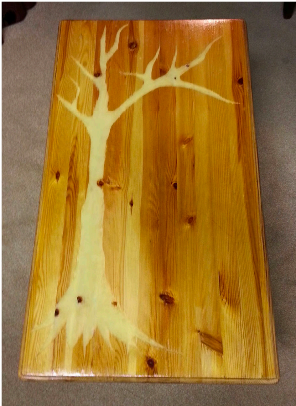
Figure 1. The table that carved itself.