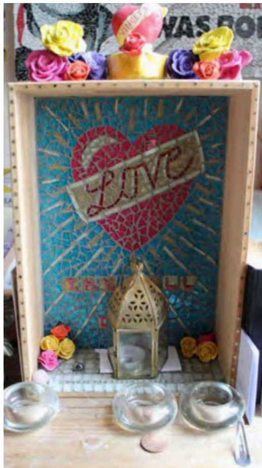
Figures 2-3-4. Love Pancake , Love Shrine and Love Sky .