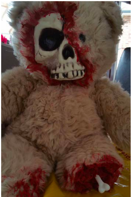
Figures 8-9-10. Halloween Child, Halloween baby2, Halloween Teddy .