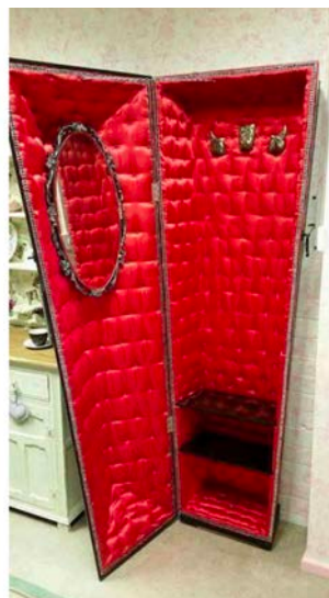
Figures 6-7. Halloween Baby and Coffin as Wardrobe .