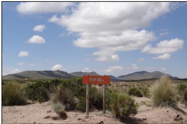
Old signboard of the “Cuprita” copper mine.

mines have been absorbed, and expanded with “Cuprita II”, an open pit project in the hands of the Bolivian company D’Cobre S.A. D’Cobre belongs to the Chinese company Chihong Zinc & Ge, which is part of the Yunnan Metallurgical Group Co. Ltd. During our visit to the mine’s processing plant, a Chinese banner at the site proudly stated that Yunnan Metallurgical Group represented a “green and low-carbon industry” and labelled Chihong as a pioneer in “circular economy pilot enterprises in China.” 7