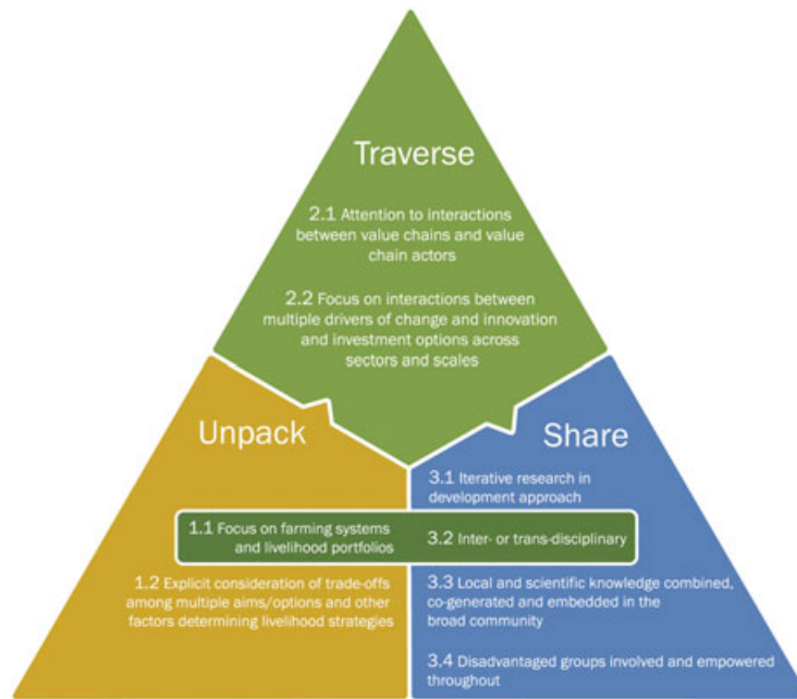
Figure 1. Three integrative principles that can operationalize the new dryland development paradigm. The principles provide a checklist for researchers and an evaluation framework for funders using the new DDP. The principles suggest that dryland development research must Unpack relationships, Traverse scales and sectors and Share knowledge. Each principle comprises a number of characteristics, two of which (1.1 and 3.2) cross-cut two of the principles. [Colour figure can be viewed at wileyonlinelibrary.com ]

Appendix S2 and summarized here under each integrative principle. Table S6 provides exemplar case studies from the CRP-DS in which the principles are operationalized together, with cases ranging from local and national to global studies, across a range of agricultural systems.