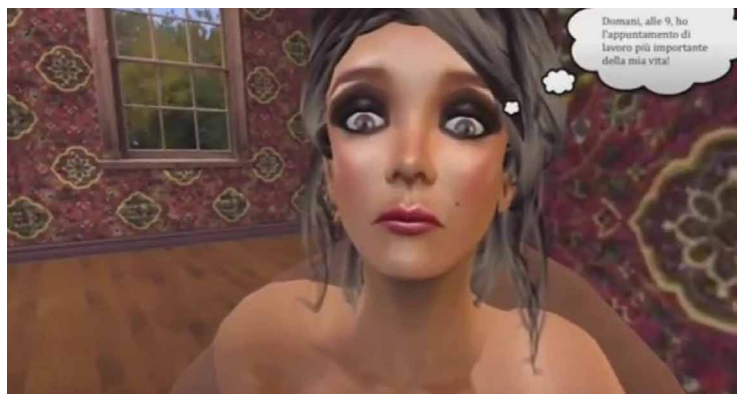
Figure 8. Excerpts of Machinima Productions Note: For video examples of machinima, see [ https://www.youtube.com/watch?v=GopJmoH3-s4&feature=youtu.be ]

Challenges observed during the training courses included time issues (e.g., the duration of time and effort required to produce even a relatively short machinima) and technical difficulties (e.g., audio-related problems which resulted in poor quality recordings); the latter was solved by overdubbing the machinima with new audio recordings (Schneider, 2015b). Another challenge was the different language backgrounds of the participants. Though English was used as lingua franca to communicate, not all participants had the same level of English, and this occasionally caused misunderstandings. Despite the challenges, teachers reported that their English had improved significantly during the course through collaboration, and reading and listening to dialogues during the filming sessions (Tsou, 2011; Schneider, 2015b). Though all teachers were highly motivated and engaged in the training and