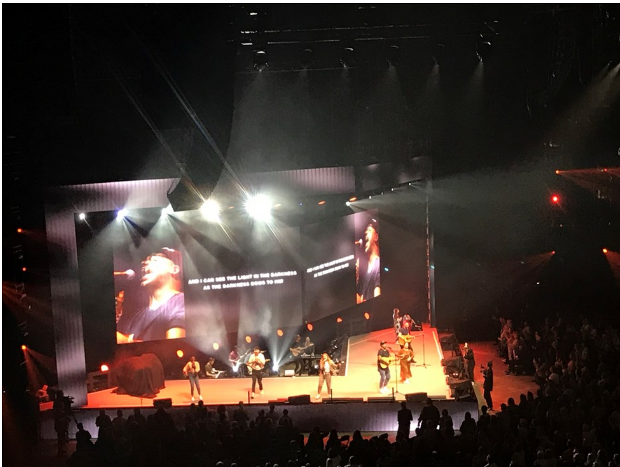
Figure 4: Cherish Conference, First Direct Arena, Leeds, UK

In interviews with the exhibition organisers it became evident that there were experiences of the numinous by staff. Such experiences have been studied elsewhere; according to research by Cameron and Gatewood, museum visitors often experienced the transcendent, or found themselves in ‘spiritual communion’ (2003:67) with historical and religious objects. Latham (2013) also discovered museum visitors who reported similar encounters.