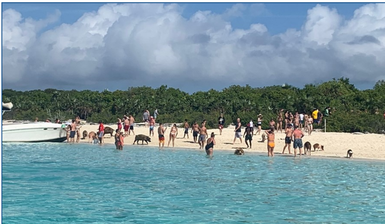
Figure 1: Swimming with pigs, Exuma, Bahamas: observing the Instagram moment

In the Internet age, we experience choice as our own, perhaps electing to create our personal moods through the music we hear, and yet we should also acknowledge that social media is clearly open to manipulation, not only in politics. The question of authenticity in events emerges strongly, as our social media echo chambers are invaded by influencers with 'unprecedented power to make things 'true'' (Boorstin, 2012:216). The prevalence of 'experiential events' as core to the marketing mix for businesses and public sector organisations including government, as well as