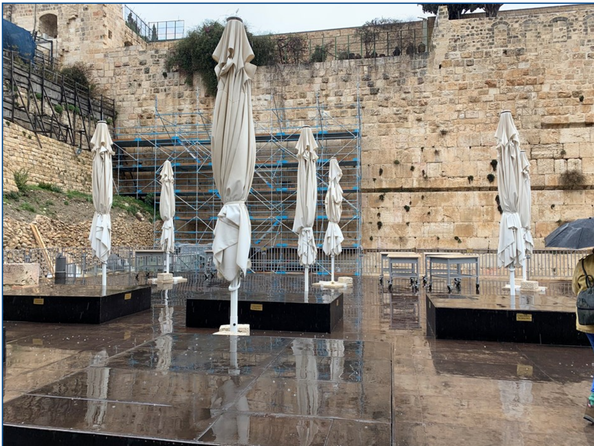
Figure 5: Commercial event space adjacent to the Western Wall, Jerusalem, Israel.

Jerusalem and the Holy Land are not without such event activities. A short walk from the holiest Jewish site in Jerusalem, the Western Wall, is an outdoor event space that is available for commercial hire. It is