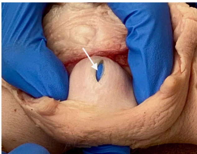
Fig. 2 Isolated rectal buttonhole tear in pig specimen (arrow)

review, Dariane et al. discuss papers describing the embryological origin, microscopic description, anatomical location, relations and function of the rectovaginal septum. They concluded that, present from an embryological stage, it is a distinct connective tissue layer between the vagina and rectum. Its function is likely to be trophic support and compartmentalisation of subperitoneal spaces, limiting expansion of infection and tumours [21]. Given these important functions, and the need for an intermediate layer of tissue to minimise the risk of recurrence, care should be taken to identify and repair the rectovaginal fascia separately.