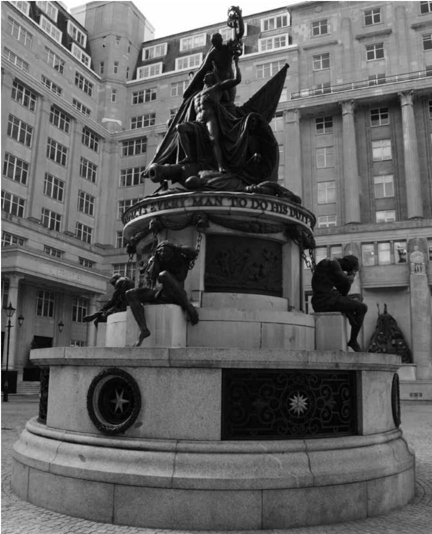
7 Nelson Memorial, Exchange Flags, Liverpool

with Rowse on these maritime designs. 81 These included the carpets in the banqueting hall, which include images of ships, a place to which Liverpool-born black elder Scott frequently took his tour participants.