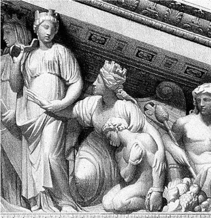
10 Close up of the figure of 'Africa' from After C.R. Cockerell, R.A. The Sculptured Pediment of St George's Hall, Liverpool c. 1850. Lithograph, 330 × 892 mm (image), 560 × 930 mm (sheet). William Grinsell Nicholl. Lithographed by Alfred Stevens. Printed by Hullmandel and Walton.

creates much more. 107 Jan Nederveen Pieterse has suggested that the emphasis in such classical representations shifted from a focus on commerce in the eighteenth century to an emphasis more on power and rule in the nineteenth century, following an imperial framework which worked within neo-classical visual cues. Drawing on a 'pictorial architecture of power', such imagery created a subtext of domination that drew on visual contrasts,