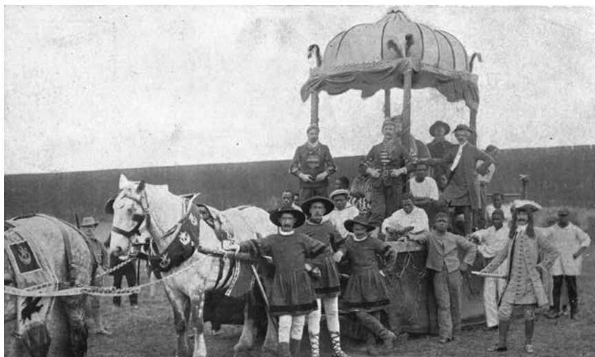
1 Liverpool Pageant, Car 'The Slave Trade.' 1907 Commemorative Postcard

This was said to add an air of authenticity, of 'intense reality', to the scene through the inclusion of actual humans to represent the 'human cargo' of the slave trade. However, local press reporting clearly illustrates how the parody of performance sanitizes this traumatic past: