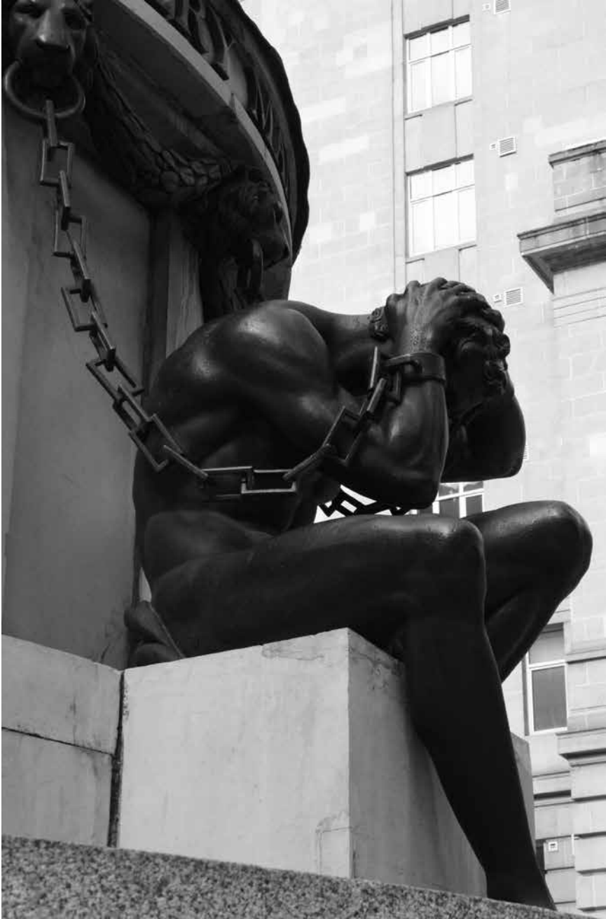
8 Figure in Chains, Nelson Memorial