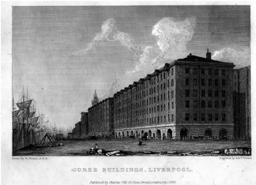
6 Goree Warehouses Engraving, 1826 copy

‘hooked’ onto specific places. 12 Most of these specific places lie at the memory of the River Mersey’s edge. In her essay ‘The Site of Memory’, Toni Morrison presents the flooding of the Mississippi river as a metaphor for water’s ‘perfect memory’, that the Mississippi is ‘remembering’ its original course when it floods, where it was before it was artificially straightened out. 13 If the river Mersey ever flooded enough to remember its own eighteenth-century course, before it was pushed back by later dock constructions on