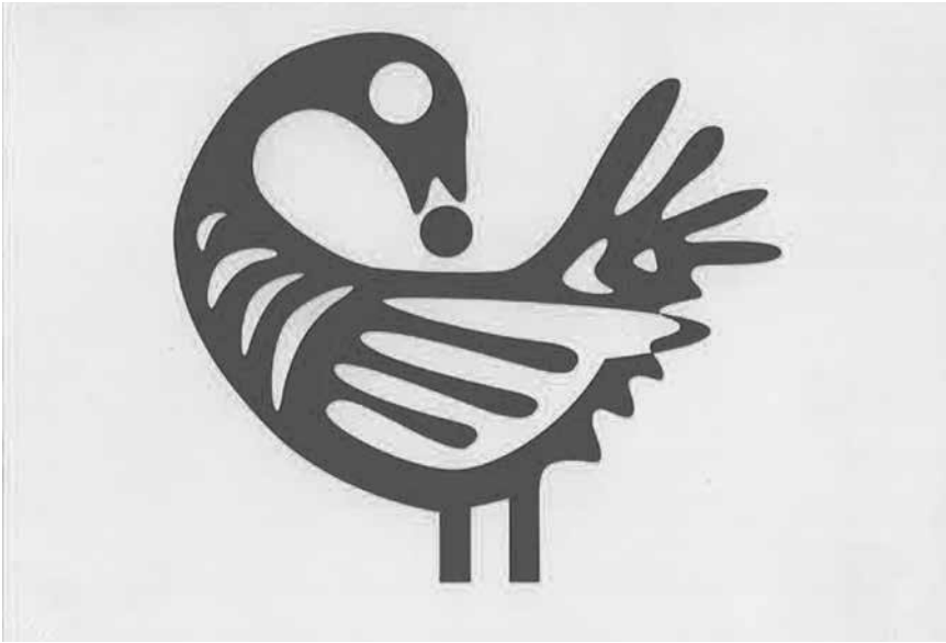
5 Sankofa Bird on Slavery Remembrance Day Postcard (National Museums Liverpool)

by a member of NML staff as being ‘firmly established as part of the city’s rich cultural life.’ 98 More and more focus was given over to accompanying entertainment – performances, song, dance, and food – which for the next few years took place at Otterspool Promenade, out of the city centre, and a bus ride away due to waterfront building work taking place by the docks. SRD was positioned as a point in Liverpool’s civic calendar by press and authoritative institutions, as Councillor Marilyn Fleming outlined: ‘August 23 is now an annual civic event, recognising its growing importance as a day of remembrance, commemoration and celebration.’ 99 SRD became discursively decoupled from slavery in public discourse through its position within a cultural calendar, it is ‘August 23’, a ‘civic event’, something important for memory and celebration, though remembering what and celebrating what exactly is rarely stated. However, it is through its ritualized performance and embodied memorialization that SRD breaks free from oppressive languages of entertainment and consumer culture.