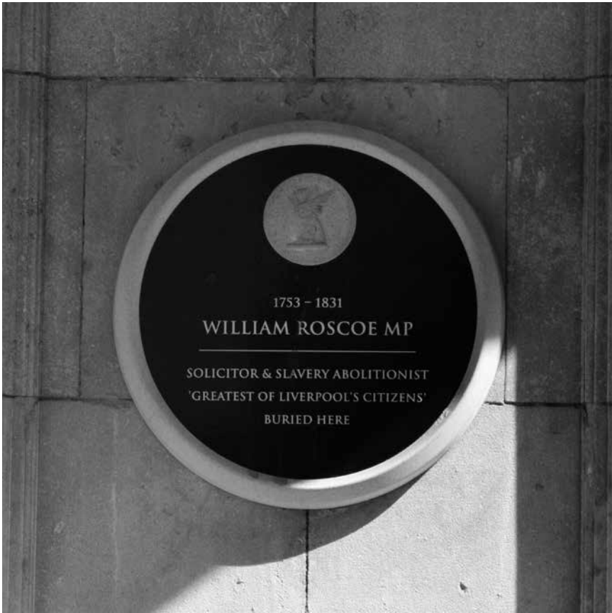
4 Roscoe Gardens Memorial Plaque, 2003