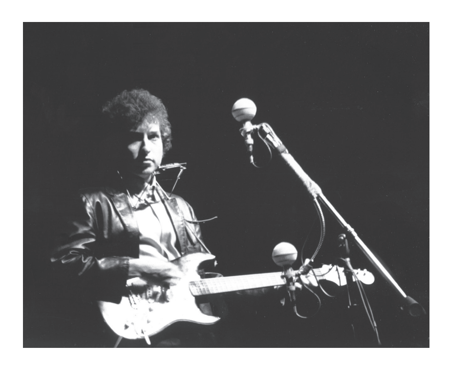
Dylan Goes Electric At Newport

NEWPORT, RI—JULY 25: Bob Dylan plays a Fender Stratocaster electric guitar for the first time on stage as he performs at the Newport Folk Festival on July 25, 1965 in Newport, Rhode Island.