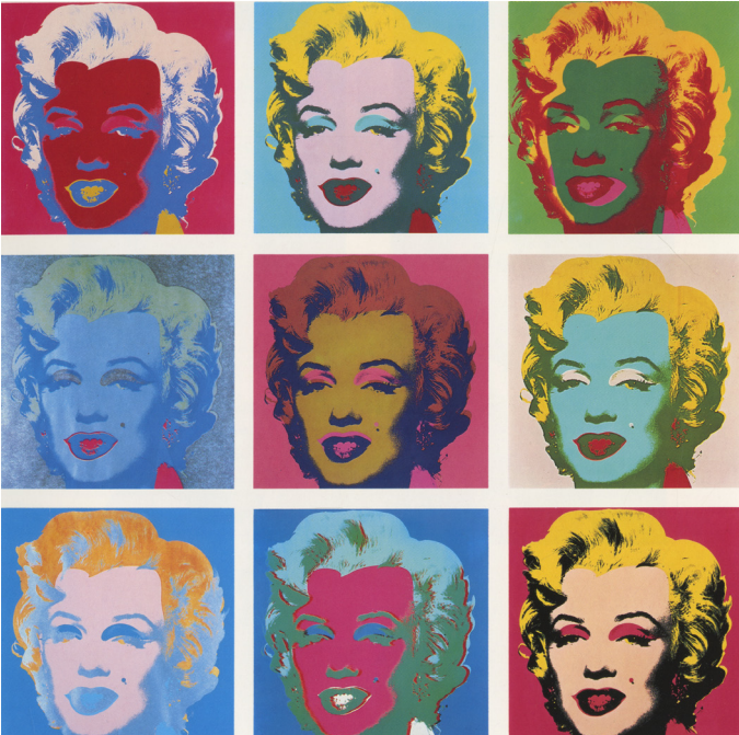
Figure 8: Andy Warhol, Marilyn Monroe . (© 2014 The Andy Warhol Foundation for the Visual Arts)