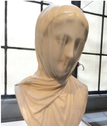
Figure 3: Giuseppe Croff, Veiled Nun .

Yet another veiled illusion/allusion. I wonder if my reply to you, in the spirit of your inquiry, could take the form of reproduction/representation. And so my “re-ply” is my favorite piece of sculpture, which I recently admired in the Corcoran Gallery in Washington D.C. The marble veil and the face were of course chiseled simultaneously by the crafty artist. I am achingly intrigued by that simultaneity.