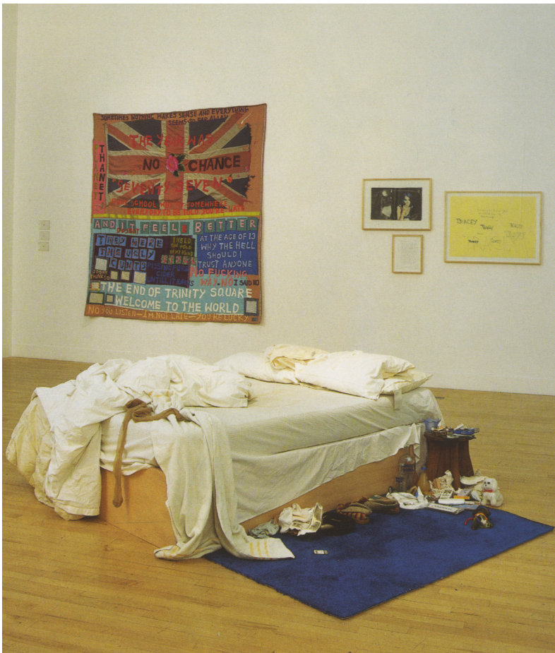
Figure 1: Tracey Emin, My Bed . (© 2014 Tracey Emin. All rights reserved.)

Hephaestus did not cobble those shoes. Sing, O Cobbler, of the Truth of Peasants. We live in a time when the foul rags of the human heart have an odd vitality, when even mud puddles can rise into a wave. But I still think the exquisite corpse of art is strangely connected to Homer’s performance, where fish rise to nibble on the blood streaming from dead Trojans as they float to immortality. And what do we make of how wrathful Achilles ends up in Hades, vaguely repenting his short, happy and murderous