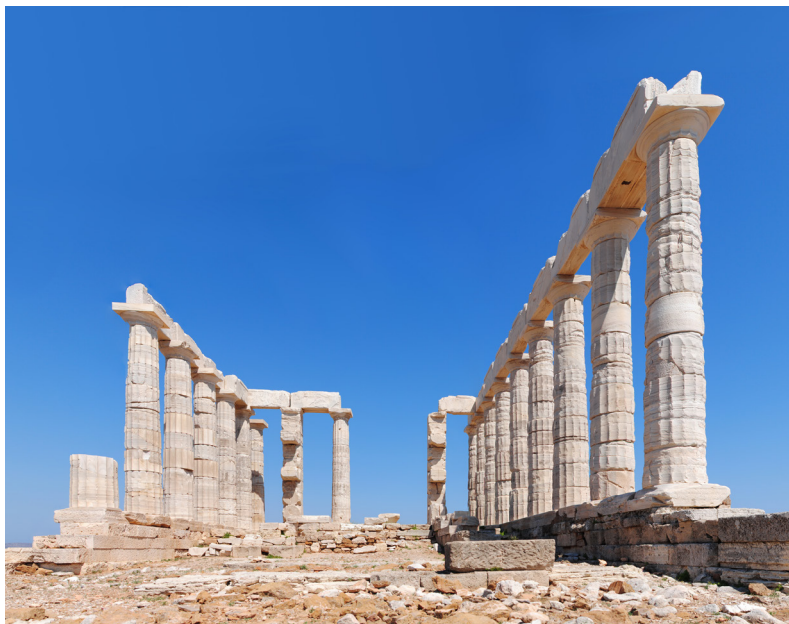
Figure 4: Temple of Poseidon.

RB: Given our discussion of Veiled Nun , I would have thought Heidegger's “truth-as-unveiling” would flutter your imagination a