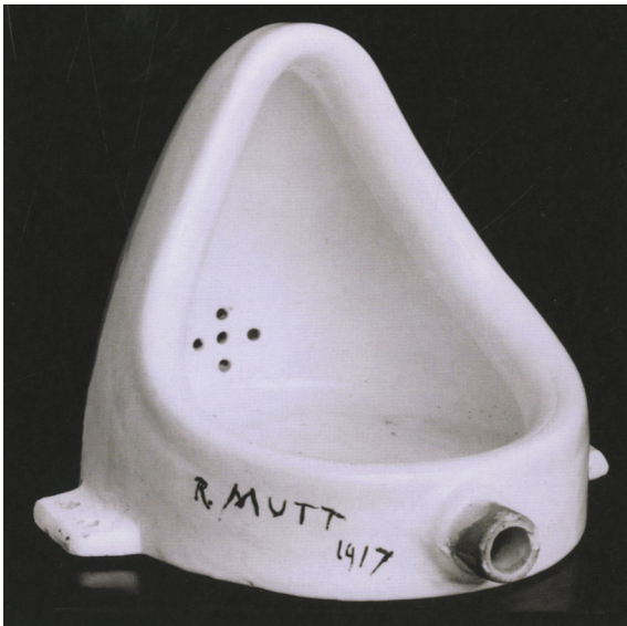
Figure 6: Marcel Duchamp, Fountain (replica). (© 2014 Succession Marcel Duchamp)

JS: Did you know that beer-swollen tourists regularly pee—or try to pee—in Fountain ? Well, they do, according to museum employees. That it is impossible to pee—or try to pee—in or on