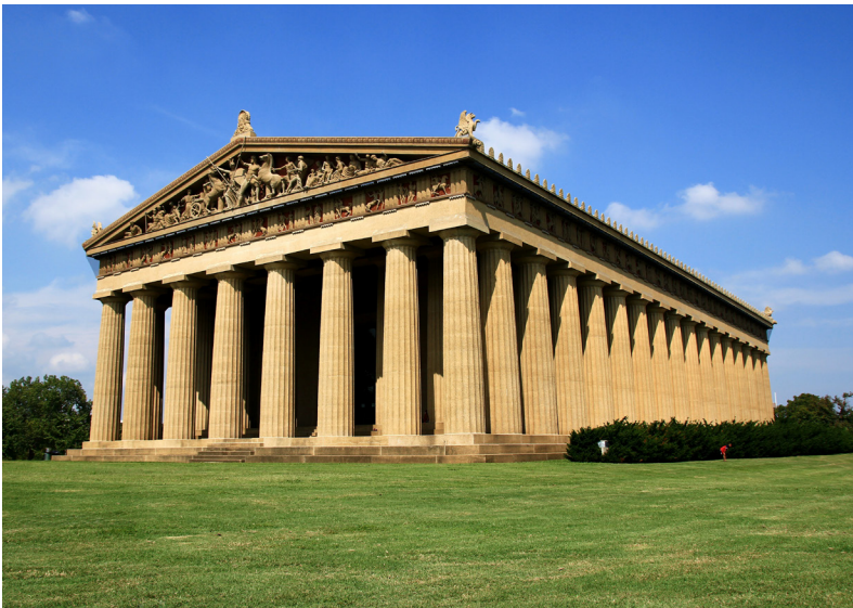
Figure 5: Nashville Parthenon.

JS: Materials matter. There is something obscene and kitschy about a concrete Parthenon. And the damned thing is already decaying after just over one-hundred years. I called your attention to the Nashville Parthenon precisely because it is so devoid of its ritualistic aura in its Dixie setting. Having said that, imagine all those bus-loads of school-kids who will never see the original on the Acropolis. Perhaps a few of them will be enlivened by Greek art and culture because of their tramping through the concrete Parthenon (they don't care that it's not marble). It is also not reduced to ruins (yet), but a perfect scale model that gives you