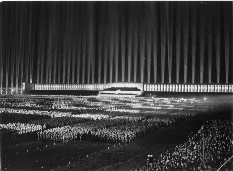
Figure 9: Albert Speer, Lichtdom .

RB: You have returned us to one of the unanswered questions with which I began, so let me re-ask it as we head toward a conclusion. Auerbach and Benjamin, both refugees from National Socialism, fled a culture dominated by the manipulation of beautifully deceptive and deceptively beautiful images. Albert Speer and Leni Riefenstahl were Hitler's Überwizards, and the Oz-like spectacles that they contrived had the effect of turning the Third Reich into a huge Gesamtkunstwerk . To what extent are Auerbach and Benjamin products of their own history, critics who seek to sensitize us to the lures of mystification, whether it is generated by seductive surfaces or cultic auras? Are they, like that other cynic, Bertolt Brecht, of Toto's party, employing alienation-effects to remind us that the man behind curtain—or maniac behind the veil—is simply pulling the strings on which we dance? Albert