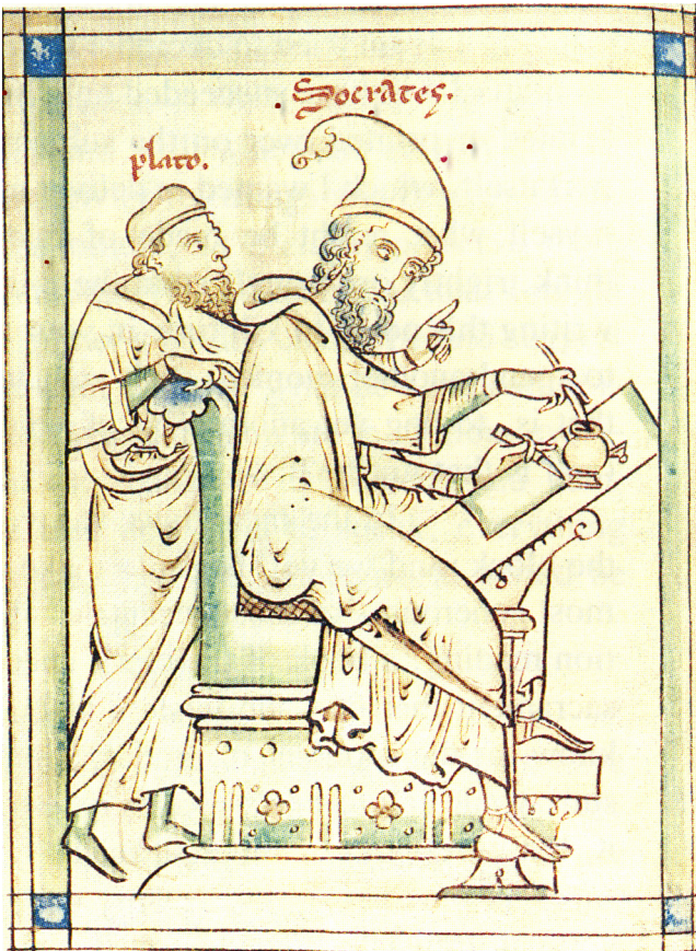
Figure 10: Frontispiece, Prognostica Socratis Basilei .

So I am forced to drive a wedge between Socrates, who wrote nothing, and Plato, who wrote voluminously, giving his teacher all his own views, standing behind him as the first term stands “behind” the second term in “Plato/Socrates.” But would Socrates “stand behind” (support, endorse) any of Plato’s metaphysical views? Is Socrates a persona for Plato the way Marlow is a persona for Conrad? These considerations necessarily bring to mind Derrida’s perversely brilliant reading of the medieval depiction of Plato standing behind a scribal Socrates.