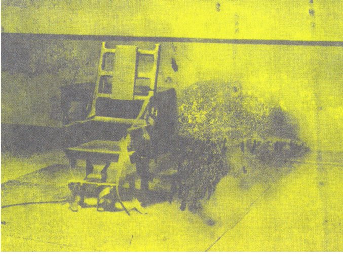
Figure 7: Andy Warhol, Electric Chair . (© 2014 The Andy Warhol Foundation for the Visual Arts)