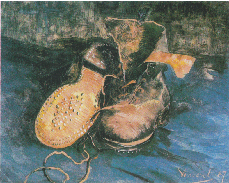
Figure 2: Vincent Van Gogh, A Pair of Boots . (The Baltimore Museum of Art).

Are Flaubert's and Beckett's banality the same as Tracey