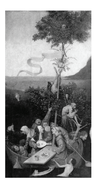
Fig. 1. Hieronymus Bosch, Ship of Fools (1490–1500)