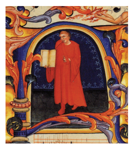
Antonio "Zachara" da Teramo Illustration from the Squarcialupi Codex.