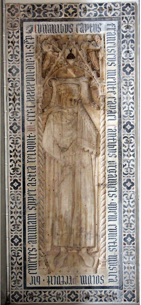
blind in both images. His is the only illumination in the Squarcialupi codex in which the face is turned to one side, leaving only one (closed) eye visible. On his tombstone, Francesco is shown face-on, but his eyes have been hollowed out, creating the impression of a cavernous, unfocused gaze.

Tomb in the interior of the Basilica of San Lorenzo in Florence; photograph taken by Sailko.