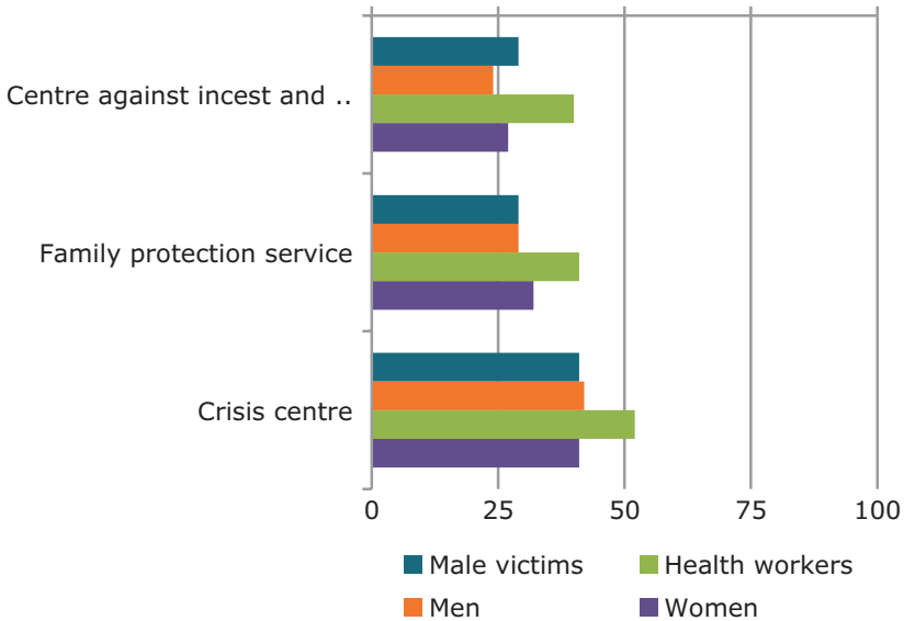
Fig. 3.2 Percentage of those aware of the services available to men subjected to violence in intimate relationships

handle it” on their own. Among those who have not sought help, over 60 per cent give this as their reason. A larger proportion of those who have been subjected to physical violence express that they would rather deal with it on their own (62 per cent) than those subjected to psychological violence (48 per cent). Many men responded that they do not generally seek help when they have problems and/or that they experience it as shameful to do so. Other respondents indicated that they feared the potential reaction of their partner or further abuse.