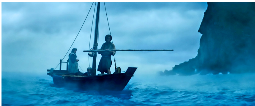
Figure 1.2 Rodrigues's hellish journey to Goto in Silence .