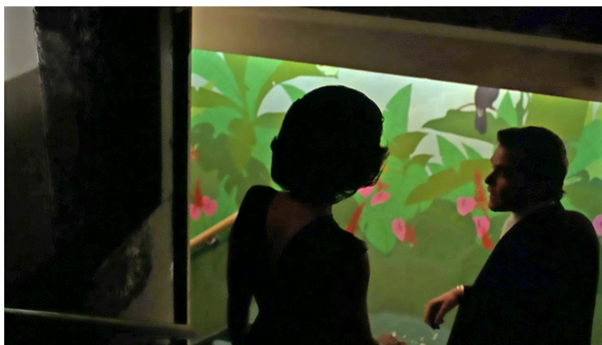
Figure 1.5 The entrance to the Underworld in GoodFellas .