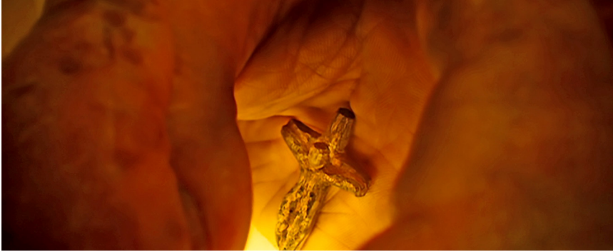
Figure 9.4 The sign of faith in Silence .

There are three guards by the coffin – maintaining a tripartite dimension until the end – but Rodrigues's wife is allowed to approach and to place inside a mamorigatana to ward off evil spirits. It is also at this point that she slips Mokichi's crucifix into Rodrigues's hands – although the audience is not clear what she has done at this stage. Although her face is impassive and she does not weep, it will later become obvious that there was a secret bond of trust between husband and wife with regard to his religion and that she knew the significance of this symbol of faith.