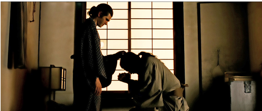
Figure 9.3 The peace of repentance in Silence .

As Kichijiro kneels down, the audience hears Rodrigues's interior prayer: 'Lord I have fought against Your silence.' Then the voice of Jesus is heard: 'I suffered beside you. I was never silent.' Placing his hand on Kichijiro's head as a sign of forgiveness, Rodrigues continues his dialogue with Jesus. In tears, he