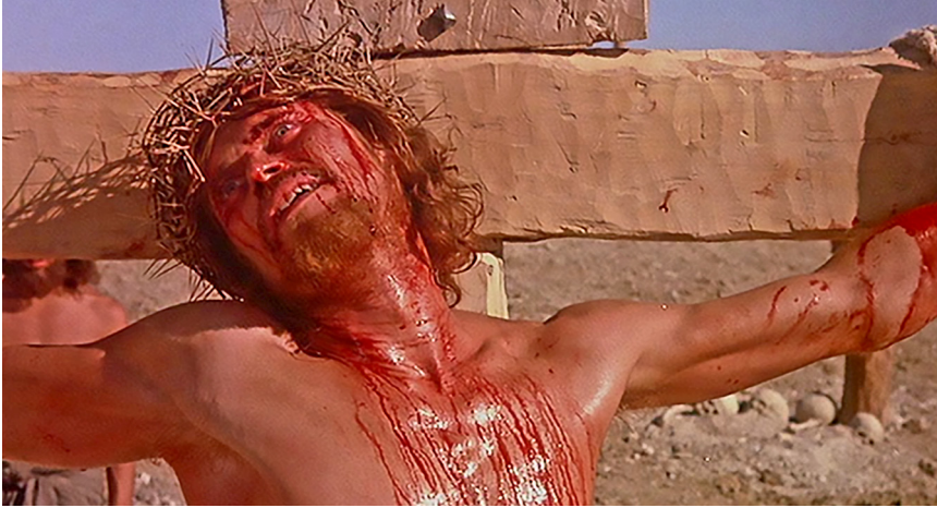
Figure 7.4 'It is accomplished!' The triumphant ending of The Last Temptation of Christ .

more could you want from life than salvation? For all of us! You'll feel great!' (in Hodenfield 2005: 183).