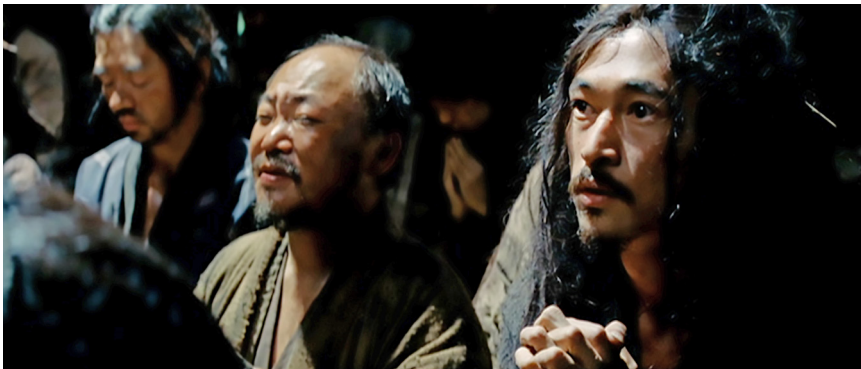
Figure 3.1 Kichijiro: traitor or suffering soul in Silence ?

Peter Stanford points to the distinction between the two flawed apostles: one is redeemed and the other is not. ‘The language, of course, is different – denial and disavowing on Peter’s part, betrayal on Judas’ (Stanford 2015: 66) and the fact