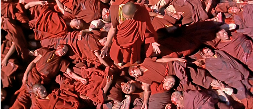
Figure 8.1 A nightmare vision for the Dalai Lama in Kundun .

are hundreds of men in red robes, so that they look like blood-stained bodies. ( Figure 8.1 ) As in The Last Temptation of Christ , it turns out to be a nightmare vision rather than reality.