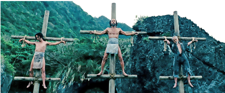
Figure 9.2 On the way to Paradise: the Tomogi martyrs in Silence .

The execution scene takes place near the caves where the priests first sought shelter when they arrived in Japan. It was the site of their landing when they supposedly brought hope and salvation – but it has now become a place of death. There are three crosses in a Calvary tableau with Mokichi in the middle. (Figure 9.2) It is believed that St Peter felt that he was not worthy to be killed in the same manner as Jesus and asked to be crucified upside down. In Silence , it gradually becomes clear that there is another dimension to the punishment, as the crosses are by the ocean, so that the incoming tide adds to the pain of