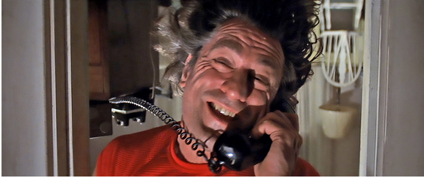
Figure 2.2 Max Cady: the avenging angel with evil intent in Cape Fear .

as Professor Do-Right, he carries out his 'search for truth', telling Danielle that her parents have punished her 'for their sins'. He advises her, 'Just forgive them, for they know not what they do' without any intention himself of turning Jesus's words at the Crucifixion (Lk. 23.34) into action. 'Every man carries a circle of hell around his head like a halo,' is his rather pessimistic view of humankind.