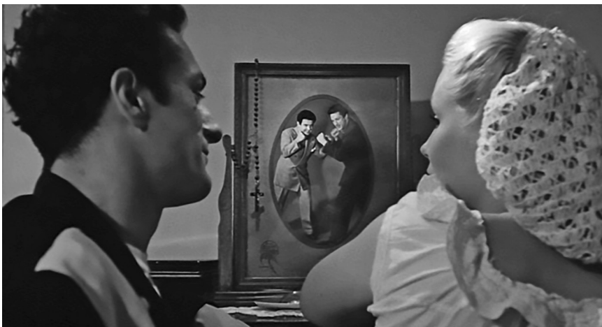
Figure 6.1 Catholic men with troubled lives in Raging Bull .

When Jake shows Vickie the photograph of himself and Joey in boxing pose, there are rosary beads draped over the frame as if to sanctify their fraternal relationship, but it is an early indication of trouble ahead. ( Figure 6.1 ) There is a photograph of Joey's wedding that is spliced into the scene when Jake returns home with his new bride – a subliminal message that Joey is an interloper in his brother's marriage (see Wernblad 2011: 37). A triangle of jealousy is created, which extends to Jake's suspicion that his friend Salvy (Frank Vincent) is also having an affair with his wife. La Motta is caught up in the Madonna – whore complex: 'It amounts to a man having such low self-esteem that he (a) cannot respect a woman who would sleep with him, and (b) is convinced that, given the choice, she would rather be sleeping with someone else' (Ebert 2008: 65).