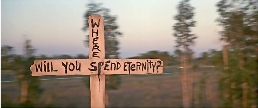
Figure 2.4 A poignant question in Cape Fear .

St Augustine explains that no one can identify who belongs to the ‘City of God’ and whether bliss or damnation awaits. In The Last Temptation of Christ , Judas asks Jesus if he is afraid of dying, and the latter replies, ‘Why should I be? Death isn’t a door that closes. It opens. It opens and you go through it.’ The question for Scorsese’s characters is: What is on the other side? In Cape Fear the family drive past a roadside wooden cross bearing the message: ‘Where will you spend eternity?’ ( Figure 2.4 ) Ratzinger argues that ‘Heaven reposes upon freedom, and so leaves the damned the right to will their own damnation’ (Ratzinger 1988: 216). Some of Scorsese’s protagonists appear to have made that choice.