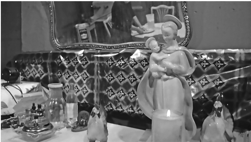
Figure 7.1 Earthly and heavenly mothers in Who's That Knocking at My Door : the first shot that sets the tone.