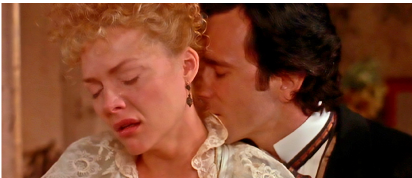
Figure 6.2 Scorsese's Paolo and Francesca: Newland and Ellen in The Age of Innocence .

One day we reading were for our delight Of Launcelot, how Love did him enthral. Alone we were and without any fear. Full many a time our eyes together drew That reading, and drove the colour from our faces; But one point only was it that o'ercame us. When as we read of the much-longed-for smile Being by such a noble lover kissed, This one, who ne'er from me shall be divided, Kissed me upon the mouth all palpitating. Galeotto was the book and he who wrote it. That day no farther did we read therein. ( Inf. V )