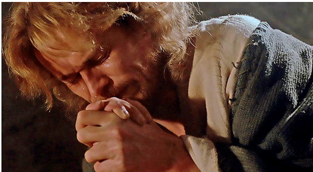
Figure 7.3 The agony in the Garden in The Last Temptation of Christ : humanity and divinity in conflict.

When Rodrigues is undergoing torment in Silence , it is Jesus's suffering in Gethsemane that he remembers. Alongside Mel Gibson in The Passion of the Christ , Scorsese offers one of cinema's most searing filmic visualizations of this episode in the Passion narrative, as it shows the reality of the sacrifice for Jesus as a human being who suffers physical pain. (Figure 7.3) However, in The Last Temptation of Christ there is no response from above but a shot of the sky through the olive trees. Then there is a breeze on the face of Jesus – a breeze being a frequent filmic representation of the Holy Spirit.