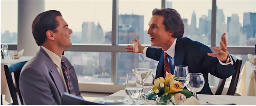
Figure 2.3 'A warm welcome to the Inferno!' in The Wolf of Wall Street .

Darkness who introduces his young colleague Jordan Belfort to evil ways in the (appropriately satanically numbered) Top of the Sixes Restaurant (666 Fifth Avenue). ( Figure 2.3 ) Hanna would certainly have found like-minded friends among the demons in Dante's Inferno :