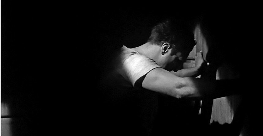
Figure 5.2 'I'm not that guy.' Repentance in Raging Bull .

underpinned by the New Testament verse that appears on screen at the end of the film: 'All I know is this: once I was blind and now I can see' (Jn 9.24-6). The biblical quotation and the dedication of the film to his former tutor, Haig Manoogian, indicate 'that Scorsese himself had achieved redemption through this character' (Raymond 2015: 30).