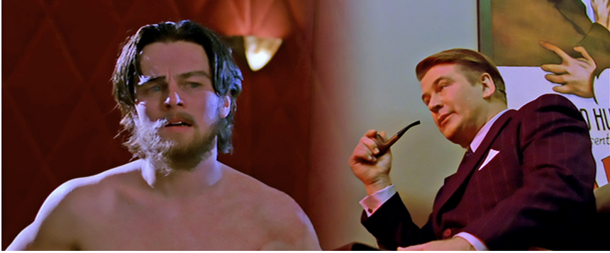
Figure 2.1 The devil at work: Trippe toys with his prey in The Aviator .

out the first time that the audience sees Trippe ‘is the precise moment when Scorsese chooses to go from the abstraction of two-color to the heightened reality of three-strip Technicolor’ (2011: 198) – an artistic decision that reflects the historical development of colour film at the same time as making Hughes’s devilish nemesis more vibrant. As Trippe toys with Hughes, puffing on his pipe as he sits outside the screening room in which Hughes has incarcerated himself, he takes on a satanic aura. ( Figure 2.1 )