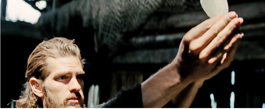
Figure 9.1 The Joy of the priesthood – bringing the Eucharist to the Hidden Christians in Silence .

Communion. ‘On that day, the faithful received fresh hope. And I was renewed,’ he reports, bringing the topic back to himself but sensing the fervour around him. The threat that these people faced will become clear to him when he returns to the islands on a second occasion and finds that the village has been ransacked and the people have fled.