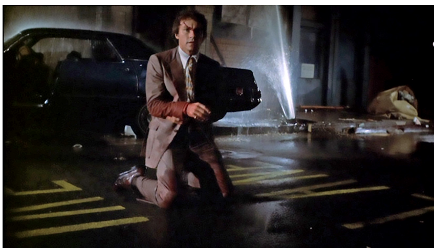
Figure 4.2 Charlie: an everyday saint among gangsters in Mean Streets .

Here of such pride is paid the forfeiture; And yet I should not be here, were it not That, having power to sin, I turned to God. ( Purg. XI)