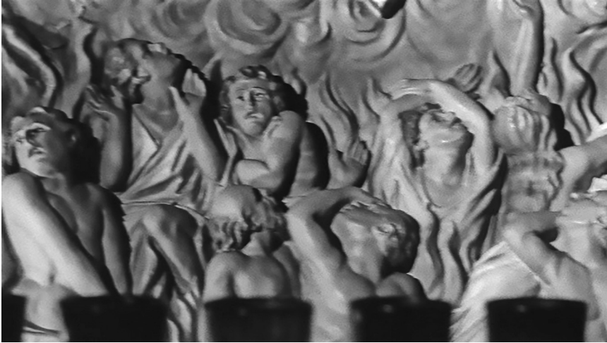
Figure 4.1 The souls in Purgatory in St Patrick's Old Cathedral in Who's That Knocking at My Door .

mountain only in the sunlight, a fact that delays their journey. According to Catholic teaching it was assumed that all people would go to Purgatory except the very holy (the saints and martyrs) and the irredeemably evil. Joseph Ratzinger clarifies that 'Purgatory is not, as Tertullian thought, some kind of supra-worldly concentration camp where man is forced to undergo punishment in a more or less arbitrary fashion. Rather it is the inwardly necessary process of transformation in which a person becomes capable of Christ, capable of God and thus capable of unity with the whole communion of saints' (1988: 230). Critics have pointed out that the promotion of Purgatory 'became a way of increasing control over this life, through the twin institutions of prayers for the dead and the sale of indulgences' (Shaw 2014).