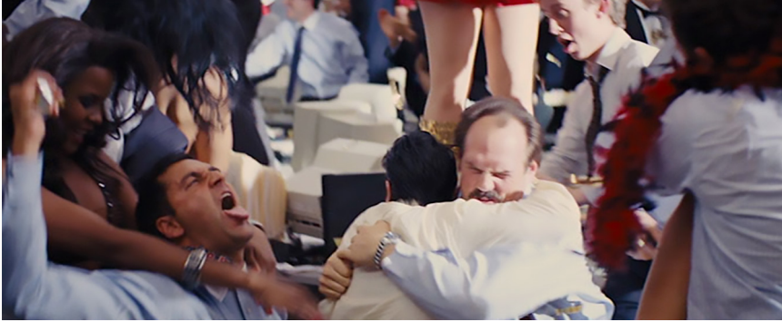
Figure 1.3 The world of Stratton Oakmont: Heaven or Hell in The Wolf of Wall Street ?

the developers. Scorsese saw the scene in apocalyptic terms: 'I'm not asking you to agree with the morality – but there was the sense of an empire that had been lost, and it needed music worthy of that. The destruction of that city has to have the grandeur of Lucifer being expelled from heaven for being too proud. Those are all pretty obvious biblical references' (in Christie 1999: 332–3).