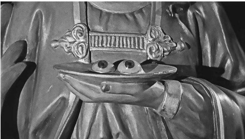
Figure 1.1 The statue of St Lucia in St Patrick’s Old Cathedral – an image of sainthood in Who’s That Knocking at My Door .

In Scorsese’s first full-length film, Who’s That Knocking at My Door , the central protagonist J.R. enters St Patrick’s Old Cathedral and the camera focuses on the wounded bodies of the plaster statues of the saints. There is St Lucia ( Figure 1.1 ) with her eyeballs on a plate – a popular female martyr who reportedly plucked