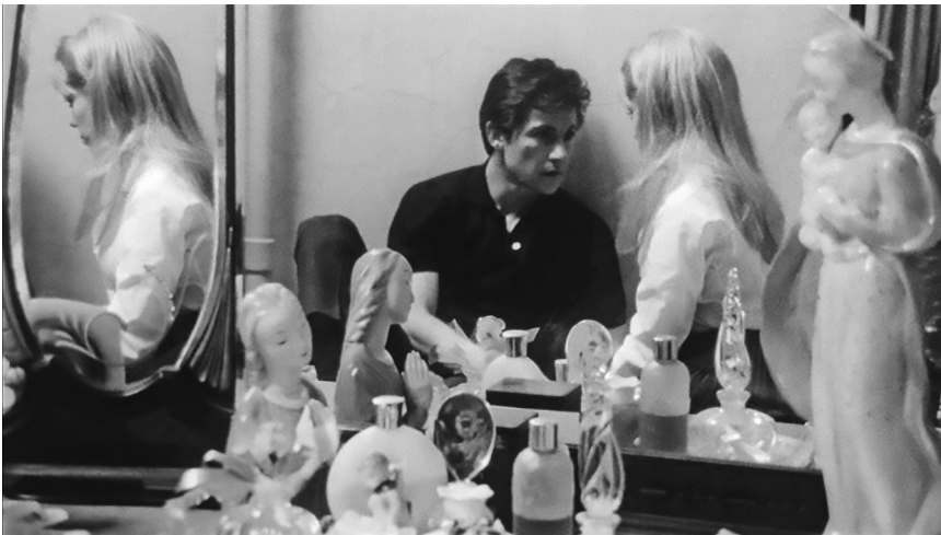
Figure 5.1 'If you love me, you'll understand.' Uncertain morality in Who's That Knocking at My Door .

It is only later that J.R.'s view of women is clarified by the 'broad' discussion after the couple leave a cinema having watched Rio Bravo (Hawks 1959). There is an abrupt switch of focus to the Girl and J.R., as he makes the sign of the cross (a traditional symbol of respect) as they walk past a church. 'A broad isn't exactly a virgin, you know what I mean. You play around with them. You don't marry