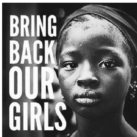
3.1 Nigerian #BringBackOurGirls campaign poster.

This type of imagery represents the classic depictions, by justice and human rights activists in Africa and beyond, of the bodily suffering of those victimized by violence. And yet such images, following Roland Barthes, represent a particular type of horror in which we observe suffering from the standpoint of our own ontological freedom: