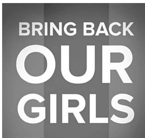
3.2 #BringBackOurGirls logo.

and 230,000 likes by July. 23 On May 7, 2014, CNN interviewed her to discuss the abduction of the Nigerian girls. Her campaign caught the attention of many US and international celebrities, who helped to propel the message further.