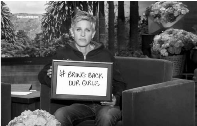
3.3 Michelle Obama, former First Lady of the United States of America.