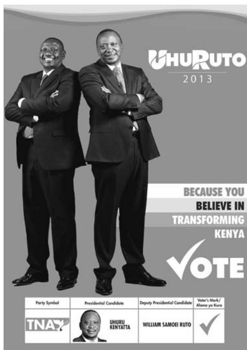
4.1 UhuRuto political campaign poster.

new postcolonial Africa, Kenyatta and Ruto were made to represent a different story through the Swahili slogan “Tuko Pamoja” (We are together) and with the top-trending hashtag #kenyadecides. Adamant about not letting the West interfere, its message responded to President Obama’s warnings—shown nightly on Kenyan news stations—that Kenyans should not elect ICC indictees as the country’s leaders. But the refrain prevailed: Kenyans had a right to decide for themselves who their leaders would be.