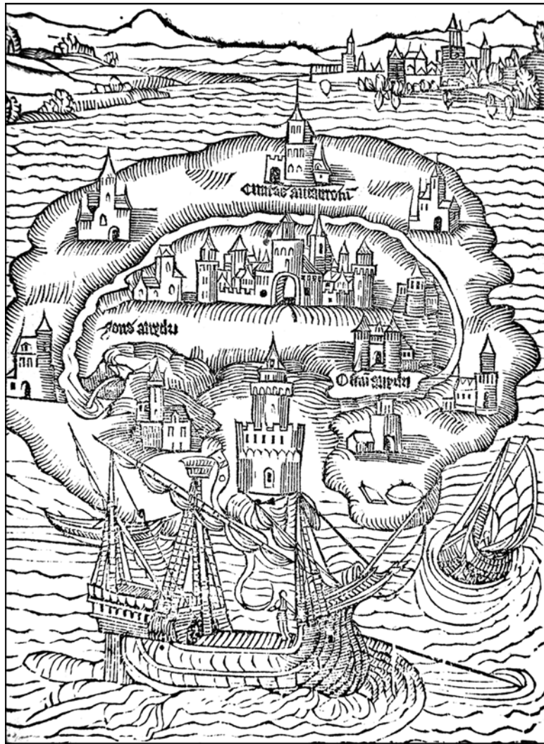
Figure 20. Thomas More, A Map of Utopia