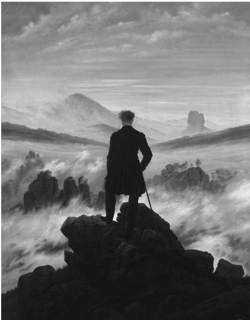
Figure 15. Caspar David Friedrich, Wanderer above the Sea of Fog

I like everything to be real and right; And I like it because it would be so even if I didn't like it. Therefore, if I die now, I will die happy, Because everything is real and everything is right. They can pray in Latin over my coffin, if they like. If they like they can dance and sing around it. I have no preferences regarding a time when I will no longer be able to have preferences. Whatever will be, when it is, is the thing that will be. (Caeiro, 1914: 137-38)