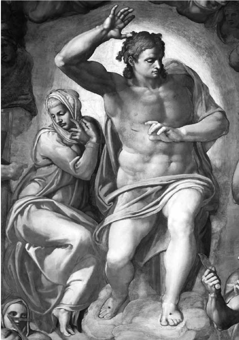
Figure 21. Michelangelo Buonarroti, Christ as Judge of the World

It has become apparent that whole masses of human population are, as a whole, inferior in their claim upon the future to other masses [...]. [T]he men of the New Republic will hold that the procreation of children who, by the