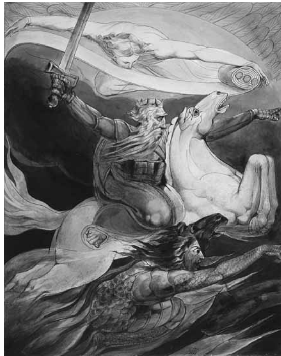
Figure 2. William Blake, Death on a Pale Horse

Within any narrative canon, whether the upheaval depicted verbally or visually is small and confined to the sphere of domesticity (the archetypal Jane Austenian plot of the nineteenth-century domestic novel of manners), or more considerable, in plots of somewhat wider socio-moral import (Dickens, Tolstoy), or massively transformative (fictions of the end of the world), a common thread can be found that changes stasis to revolution and steady-state worlds into scenarios of significant difference.