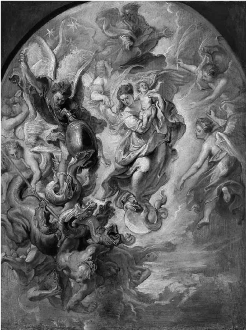
Figure 16. Peter Paul Rubens, The Virgin as the Woman of the Apocalypse .

The Woman of the Apocalypse appears in Revelation 12: 1-18. 'And a great sign appeared in heaven: A woman clothed with the sun, and the moon under her feet [...] And being with child, she cried travailling in birth [...]. And there was seen another sign in heaven [...] a great red dragon, having seven heads and ten horns [...]. And his tail drew the third part of the stars of heaven and cast them to the earth. And the dragon stood before the woman who was ready to be delivered: that, when she should be delivered, he might devour her son. And she brought forth a man child, who was to rule all nations with an iron rod. And her son was taken up to God and to his throne. [...] And there was a great battle in heaven. [...] And that great dragon [...] who is called the devil and Satan [...] was cast unto the earth: and his angels were thrown down with him.