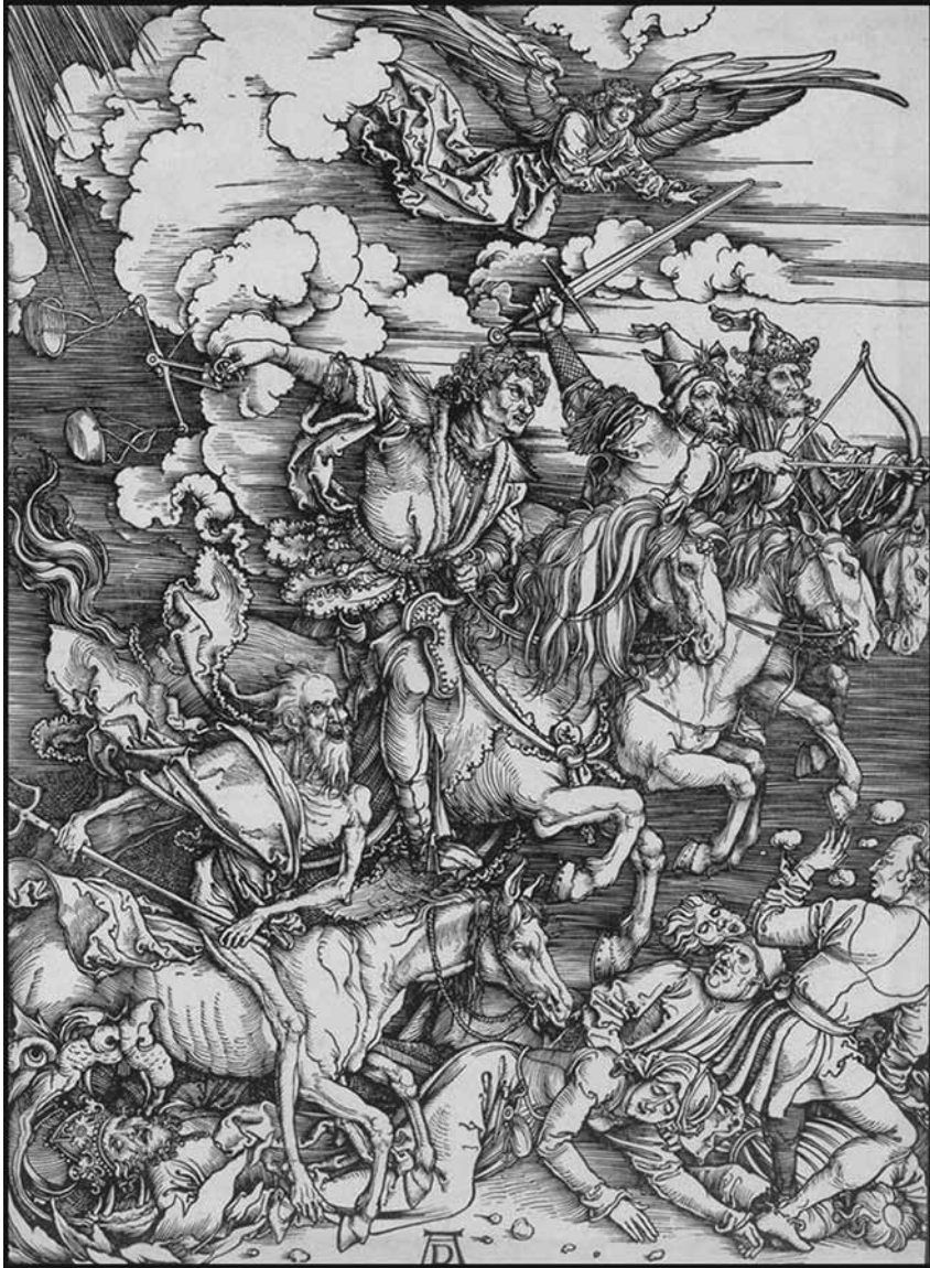
Figure 11. Albrecht Dürer, Four Riders of the Apocalypse

of the Interior who orders a massive strike against the Soviet Union. In a nail-biting climax, the former President, discovered to be alive, orders the destruction of Air Force One, the Secretary of the Interior's command plane, with seconds to spare before the order is issued to escalate the nuclear conflict.