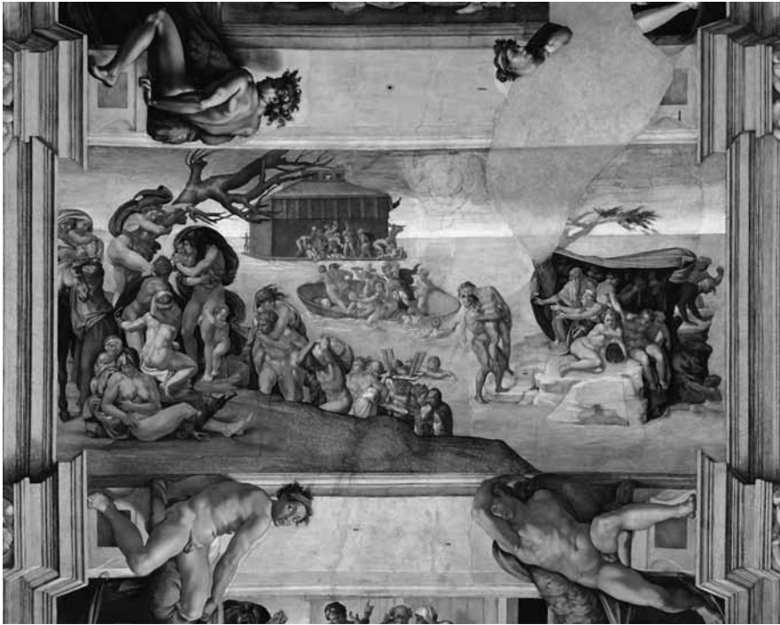
Figure 24. Michaelangelo Buonarroti, The Flood (right panel view)

At the end of Timothy Findley's Not Wanted on the Voyage (Findley, 1987), a re-telling of the story of the Flood in Genesis, God/Yaweh is dead. And not just dead but defiled, his body devoured by flies. In his place remains Yaweh's best friend, Noah (Dr. Noyes), a cruel patriarch guilty of infanticide, eugenicide, humanitarian abuse, animal cruelty and incest, who rules tyrannically over his wife, their three sons and their sons' wives, one of whom, Hannah, he has impregnated, and upon whom he has begotten a throwback, an ape-child who is immediately put to death. Not a good beginning to a New Beginning. In 'The Second Coming' Yeats warns of just that: