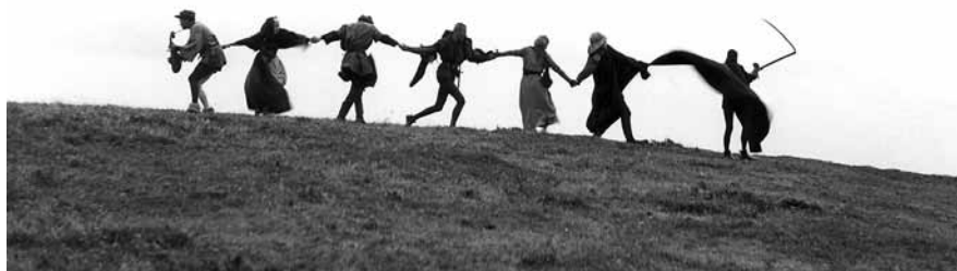
Figure 18. Ingmar Bergman, The Seventh Seal

Elsewhere apocalypse, construable as an act of God, becomes at best an intellectual impossibility and at worst the vanishing point of the believing self, as epitomized by the plight of Arthur C. Clarke's Jesuit astrophysicist who, in 'The Star,' loses his faith when he discovers that the creation of the star of Bethlehem required the destruction of an entire planet (and a worthy one, at that) by an exploding supernova: