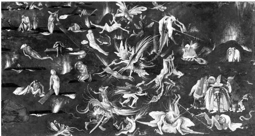
Figure 1. Hieronymus Bosch, The Last Judgement

It is perhaps for this reason that themes and archetypes more naturally to be expected in adult fiction and art are in fact pre-empted by reading experiences in childhood and adolescence. The struggle between good and evil, and the fearful possibilities opened up by the eventuality of the