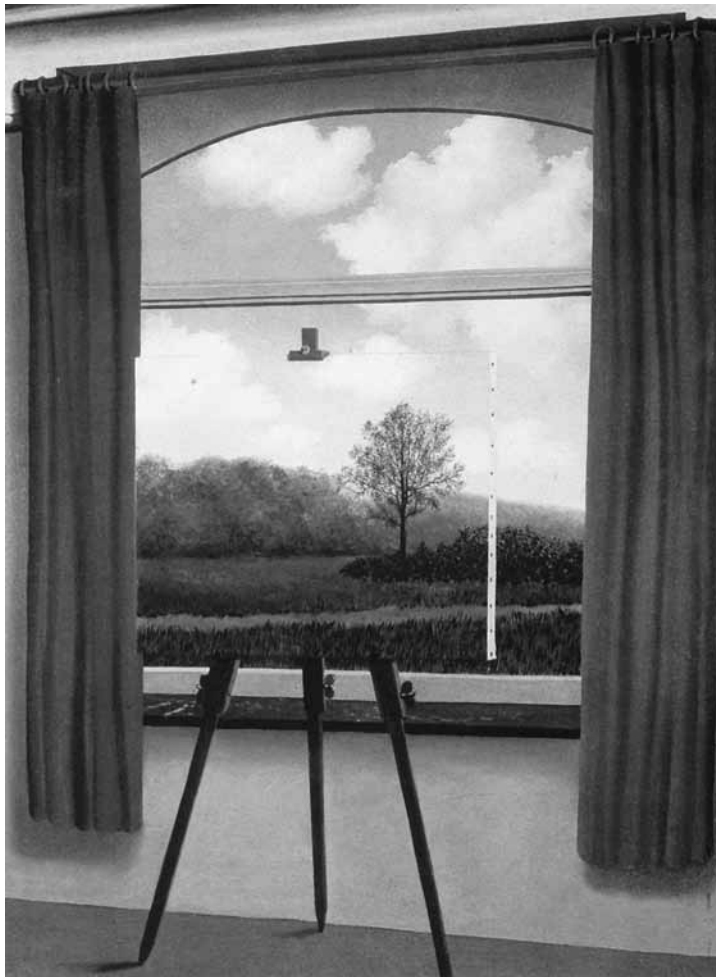
Figure 19. René Magritte, The Human Condition

While in works such as John Wyndham's The Chrysalids (Wyndham, [1955] 1984) and The Midwich Cuckoos (Wyndham, [1957] 1984) or Theodor Sturgeon's More Than Human (Sturgeon, 2000) humanity is forced to face