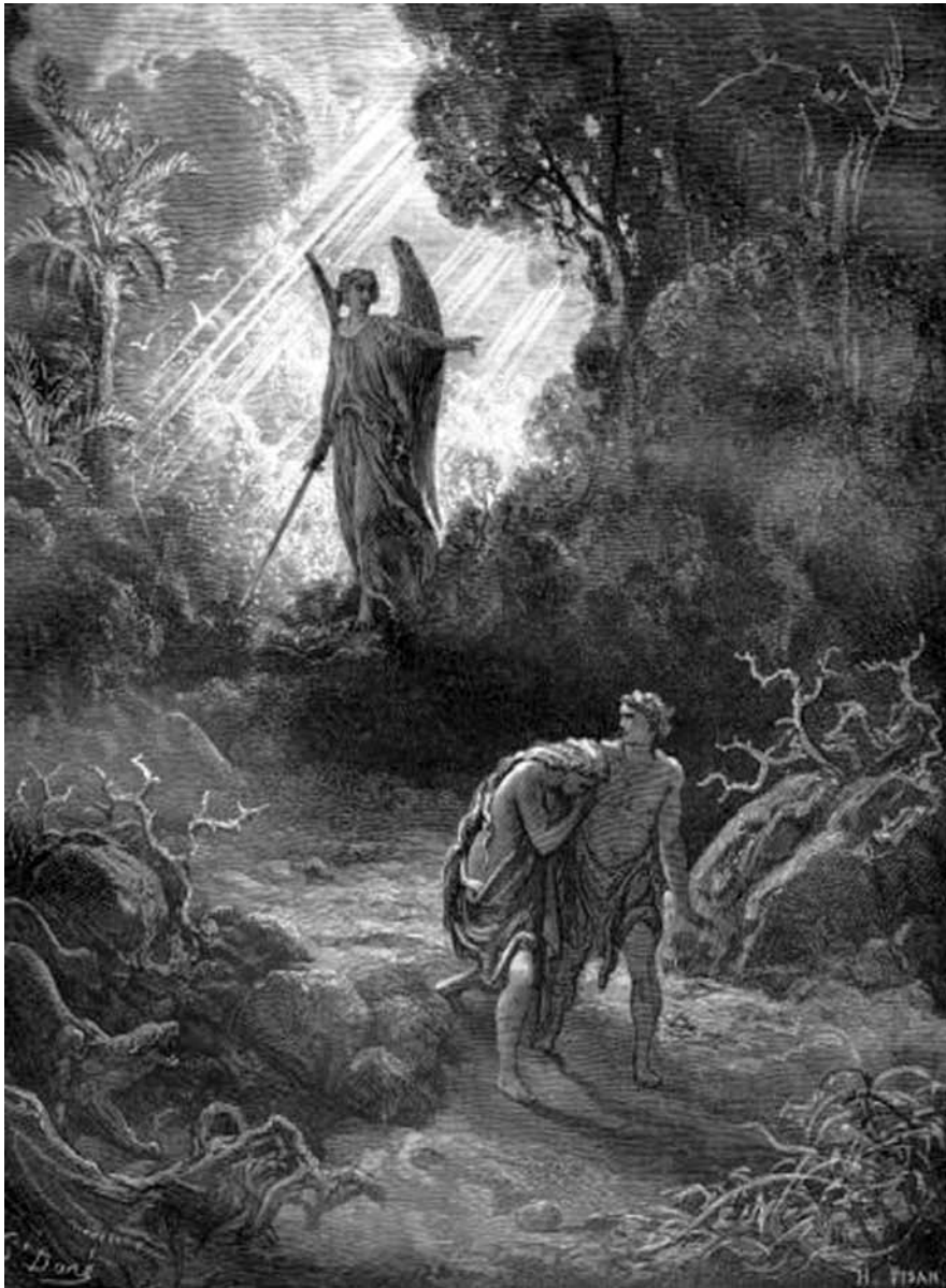
Figure 10. Gustave Doré, Adam and Eve Driven Out of Eden

Fall. When Adam and Eve were driven out of Eden in the opening chapters of Genesis, that particular world, albeit at that point admittedly restricted to a population of two, came to an abrupt end.