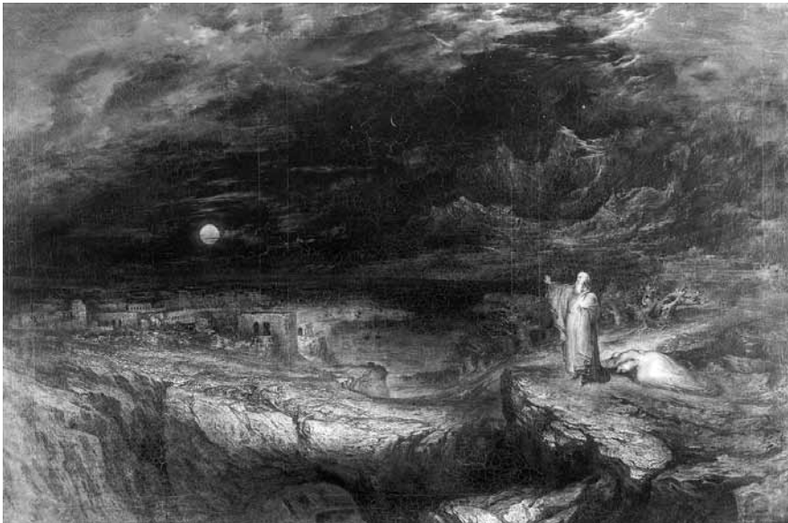
Figure 9. John Martin, The Last Man

In Ancient Greece the ruling deities, for all their capriciousness, confined their destructive rampages to individuals, or at most to selected groups (of which the Trojans are an example). In the Western consciousness, narratives of apocalypse began with the Flood in Genesis, or arguably as early as the