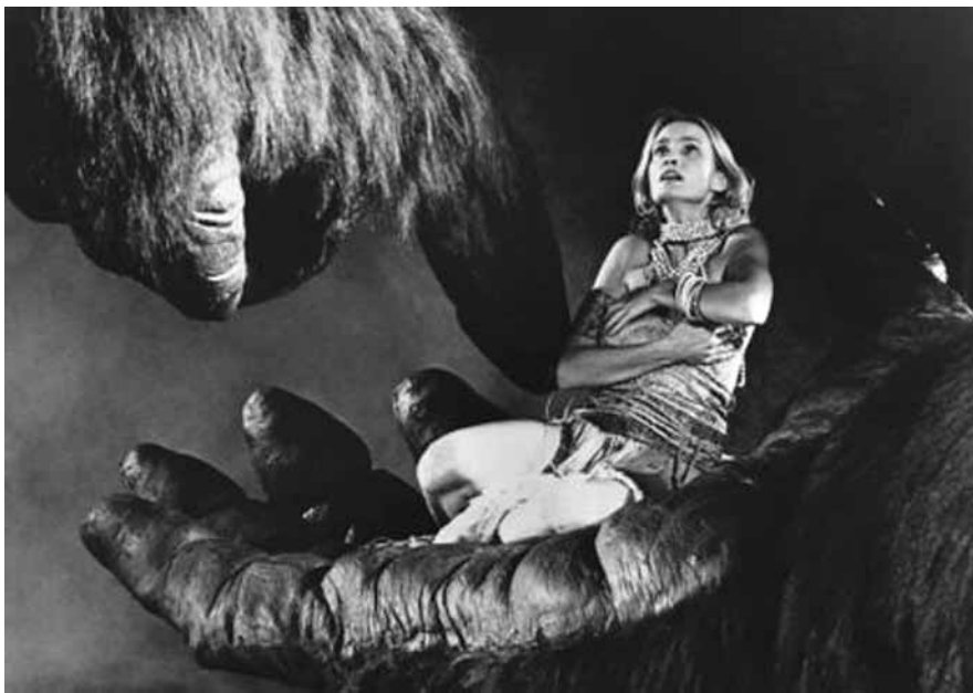
Figure 7. John Guillermin King Kong (1976)

The blonde is the time-honoured trope of fantasy. She may be the theory, however, but she is not necessarily the praxis, and in this game of courtly love, the big ape is no exception to the masculine rule, with the added bonus that, species-difference notwithstanding, its/his love for the girl, evinced through an improbable semblance of flirtatiousness, is real. In a moving