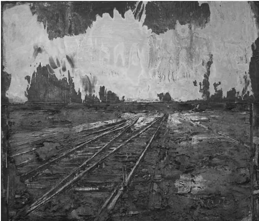
Figure 14. Anselm Kiefer, Lot's Wife

The fact that imagining the world as it should be is almost as tricky as imagining no world at all is discussed in chapter 5 with regard to visions of utopia. In either case, ultimately, if the unimaginable – whether unimaginably bad or unimaginably good – is just that, ie. unimaginable, it stands to reason that in attempting to imagine it we fall back upon