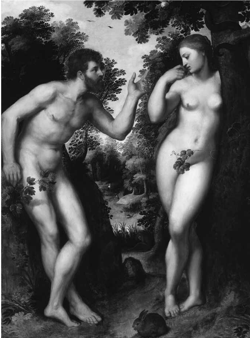
Figure 6. Peter Paul Rubens, Adam and Eve in Paradise

civilized humanity's self-assuredness ('look how far we have come'), but, paradoxically, also casts an unexpected light on the ways in which contemporary, scientific and urban statuses quo compare unfavourably with the untarnished wholesomeness of the wild ('look how badly we have turned out'). It is Kong, the wild beast, for example, rather than his human