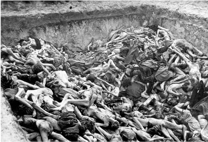
Figure 12. Reuven Dafni, Corpses in a Mass Grave, Bergen Belsen

possible, requiring the process of witness testimony acting as both haunting memory of loss and affirmation of survival: 'We must create a new language in which to speak of this in order to destroy the old language which, in its decrepitude and decline, made facile and easy the demonic descent' (Cohen, quoted in Berger, 1999, 60). For Cohen, post-apocalypse, the destruction of an advanced civilization offers the opportunity for a return to what truly matters.