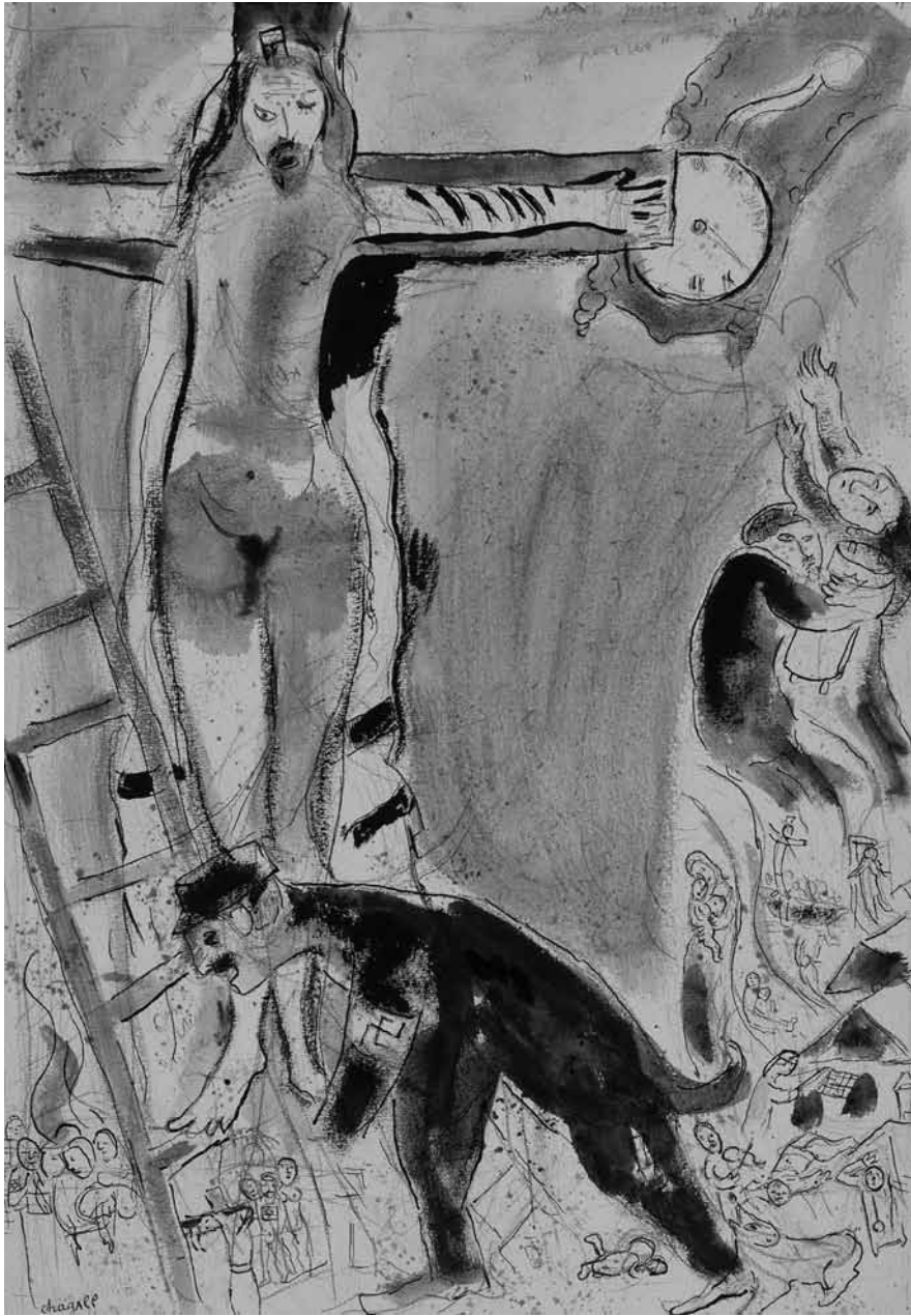
Figure 13. Marc Chagall, Apocalypse in Lilac, Capriccio

If anti-Semitism involves the assertion that the Jews killed Jesus Christ, in this image a culture-like figure of Hitler, identifiable by the moustache and swastika, appears to pick at miniature figures of people sheltering under the ladder that leans against the cross where Christ hangs crucified.