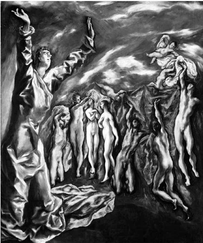
Figure 22. El Greco, The Opening of the Fifth Seal of the Apocalypse

Millenarian fear and desire both involve the ability to imagine cataclysm: in the case of the former as a cause, and in the case of the latter, as a means to an end. The logic of a purge prior to a new beginning can be detected in the earnest reasoning of prominent opinion-formers and decision-makers over the centuries, including some of those at present empowered with the means to actually bring it about. The belief in an imminent near-global