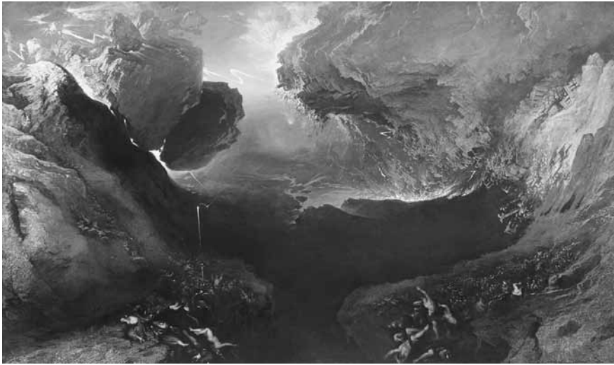
Figure 23. John Martin, The Great Day of His Wrath

Lo! Death has reared himself a throne In a strange city lying alone Far down within the dim West, Where the good and the bad and the worst and the best Have gone to their eternal rest. [...] No rays from the holy heaven come down On the long night-time of that town; But light from out the lurid sea Streams up the turrets silently — [...] While from a proud tower in the town Death looks gigantically down. [...] No swellings tell that winds may be Upon some far-off happier sea — No heavings hint that winds have been On seas less hideously serene. But lo, a stir is in the air! The wave — there is a movement there! [...] Down, down that town shall settle hence, Hell, rising from a thousand thrones, Shall do it reverence. (Poe, 2003: 22-23)