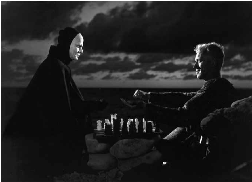
Figure 17. Ingmar Bergman, The Seventh Seal

The opening of the seventh seal inaugurates end-time, following which comes rapture and salvation, albeit only for the chosen.