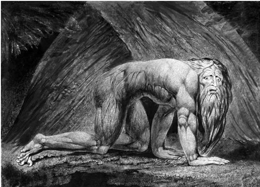
Figure 4. William Blake, Nebuchadnezzar