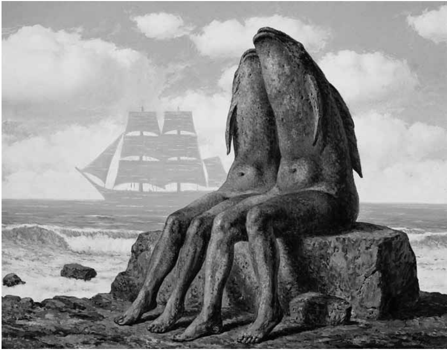
Figure 5. René Magritte, The Wonders of Nature

In Philip K. Dick's The Simulacra (Dick, 2004), too, in the aftermath of widespread radioactive contamination, Neanderthal-like humans begin to be born in northern California, itself now returned to an immensity of primeval forests, while in William Blake's Nebuchadnezzar , the Biblical character from the Book of Daniel is punished by God for boasting of his achievements and erecting an idol. The punishment sees him losing his reason and reverting to animal status.