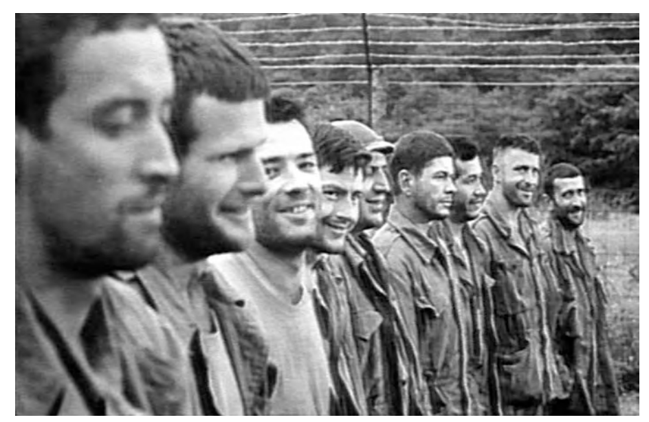
THE DIRTY DOZEN

duty-based) motivation for the trainees and on their special, highly flexible skills at "project-oriented work", the concept of purposeful action underlying the film points towards a new, post-Fordist economy with its normalization of flexible social subjectivities.<sup>23</sup> What we can see anticipated in the film is the cohesive team-spirit and self-management of 'professional subcultures' in performing non-routine tasks (to use the language of the 'cultural turn' in post-1970 management theories), a system of production based on the 'social capital' of affective labor, tacit knowledge and undisciplined communication (to put it in terms of recent Marxist work on post-Fordism).<sup>24</sup>