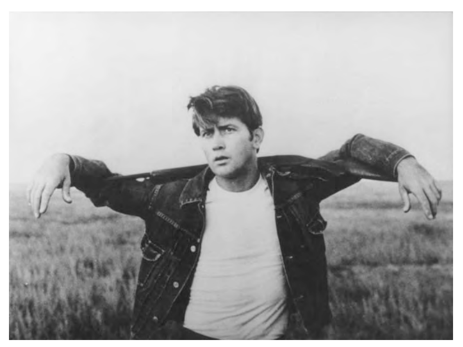
Martin Sheen in BADLANDS

the experience of war and, more often, on the experience of filming war – Coppola's Vietnam, Kubrick's, De Palma's, and perhaps Stone's, and now definitely Malick's. In this respect, there is little possibility of reading the natural images of The Thin Red Line naturally; they come to us as voiced, as authored. To take just one example, how when an auteur has not made a film for twenty years, is it possible to read just the nature in the new film's opening shot (an alligator that immerses itself in murky swamp water up to its eyes) and not also read for authorial voice, visual talent, this director's take on the war movie?