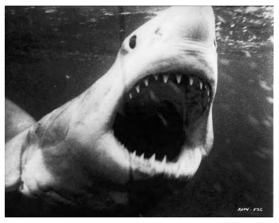
'Bruce' in Jaws

glomerates sought to renew themselves by 'attracting risk capital and creative talent which [they could] then exploit through their control of distribution', 18 or in the hacker analogy, the auteurs would have been the ones whose prototypes (but also failures) helped debug the Hollywood production system, as it slowly but inevitably moved from Fordist to post-Fordist modes of financing, marketing and asset management (notably studio-libraries of films, brands and various other types of intellectual property rights).