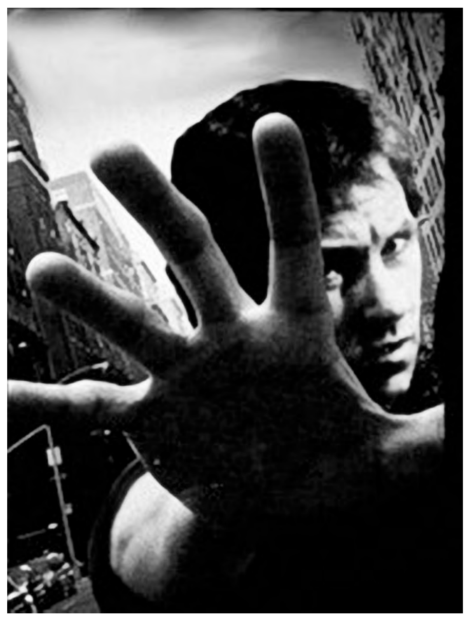
Harvey Keitel in FINGERS

Tango in Paris (1973) ilk, with their creation of a "world apart", the solitary world of an obsessive man is mobile – a pure projection along his lines of sight and movement. It is the world he observes, explores, carves out, brings into being through his Schopenhauerean will. 6