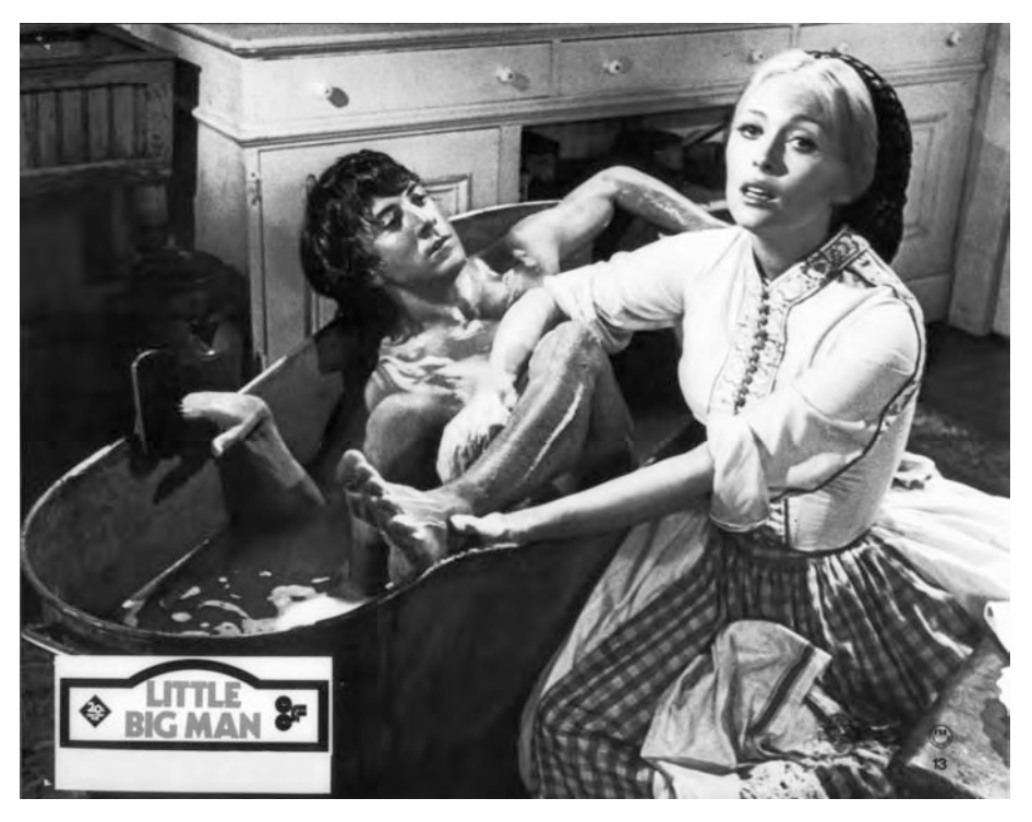
Dustin Hoffman and Faye Dunaway in LITTLE BIG MAN

(from Bonnie and Clyde to Taxi Driver); and economically, by entirely misunderstanding the willingness of a film industry – temporarily weakened by economic setbacks – to make concessions. There seemed to be no other way of resolving the dialectic between "autonomous" creativity and large investments (= expectations of profit) than by staging quasi-liberating catastrophes (from Zabriskie Point to Heaven's Gate). In many films of the New Hollywood era, these conflicts create a magnificent richness and enormous internal tensions and an incoherence, which lays bare their conditions of production and, consequently, the contradictions in American culture. As Robin Wood has observed: "The films seem to crack open before our eyes."