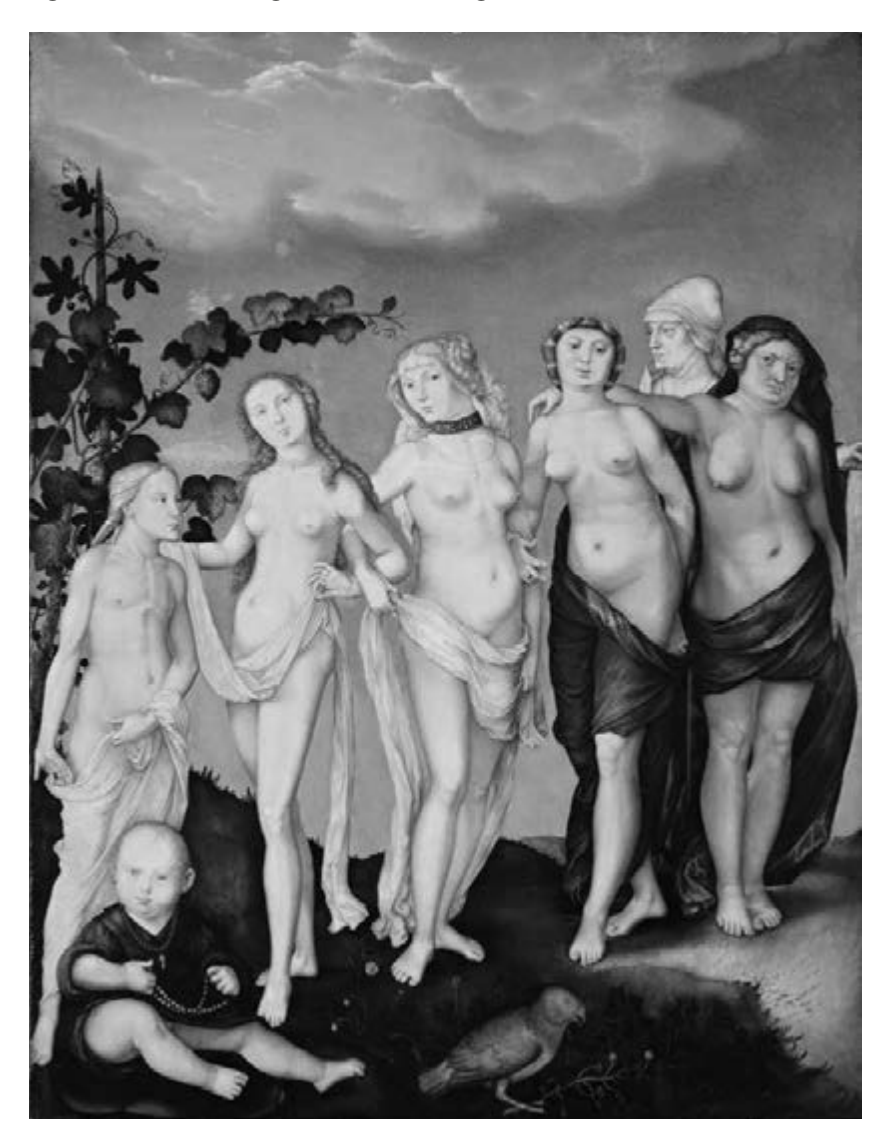
Figure I.1 Hans Baldung Grien, The Seven Ages of Woman, 1544–1545