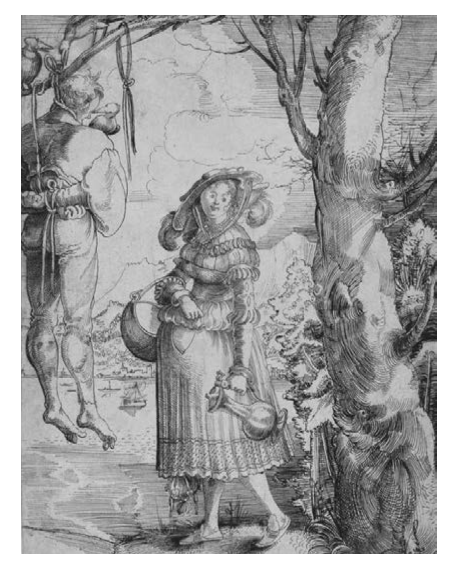
Figure 5.8 Urs Graf, Camp Follower Passing a Hanged Mercenary Soldier, 1525

and one wood, and her one eye on the lookout for clients. The tranquillity of the sunny landscape in the background serves to heighten the horror of her condition.