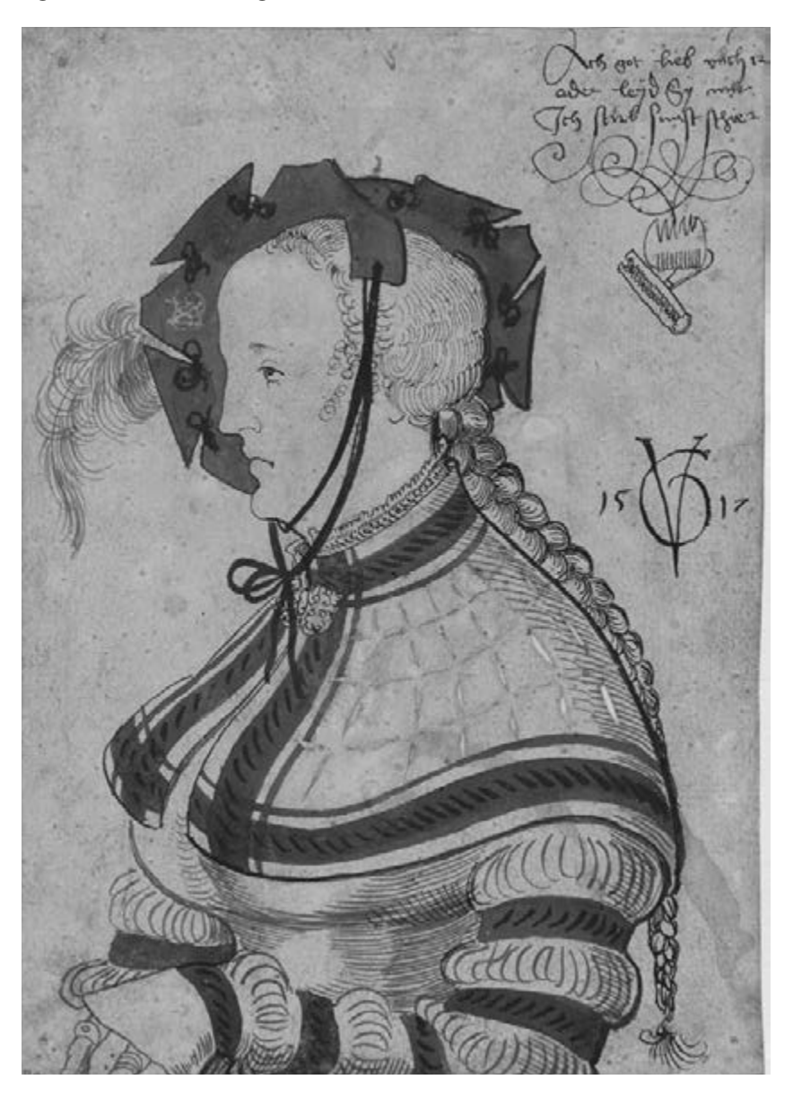
Figure 5.4 Urs Graf, Young Woman in Profile, 1517