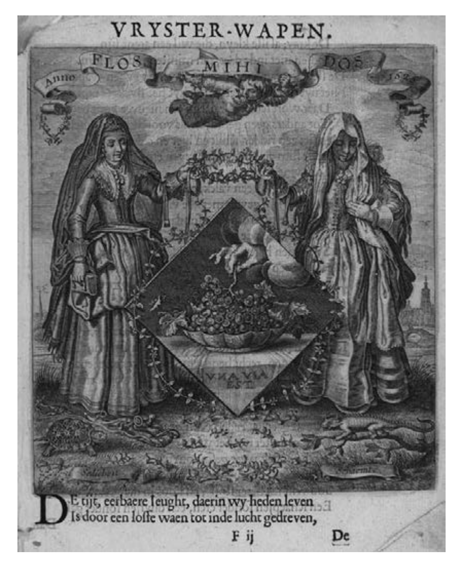
Figure 12.2 The Spinster's Arms (Vrijster-wapen) from Jacob Cats, Houwelick, 1625.

suggestion is met with a specific answer, but together the answers come down to a simple response: take marriage seriously and behave decently. Cats continues to teach the readership to have marriage on their minds in their dealings with young men.