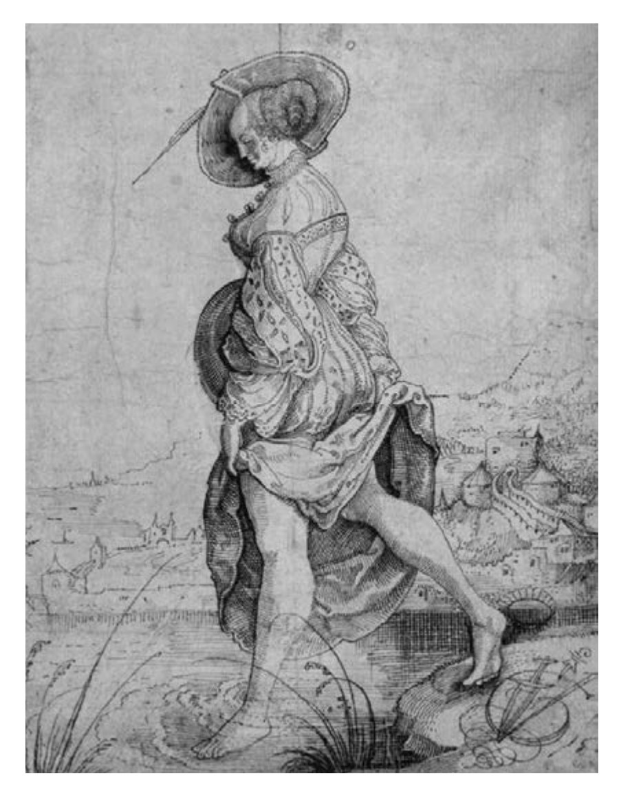
Figure 5.6 Urs Graf, Young Woman Stepping into a Brook, c. 1521

visual one offered the artist a witty formula to poke fun at a woman made to reveal the reduced state of her 'virtue' through her own action.