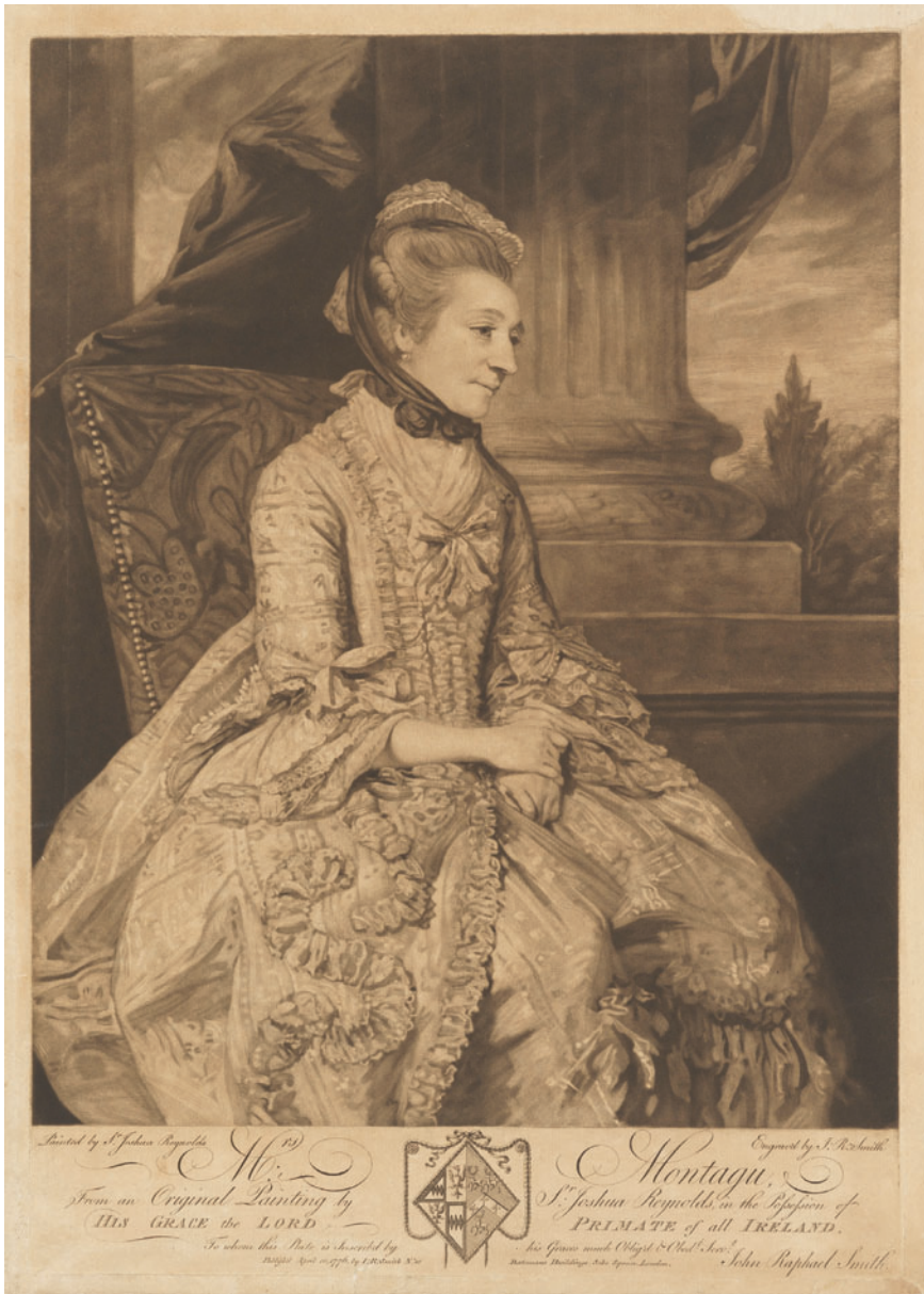
Figure 4.1 Elizabeth Montagu (née Robinson), by John Raphael Smith, after Sir Joshua Reynolds, 1776 (NPG D13746).