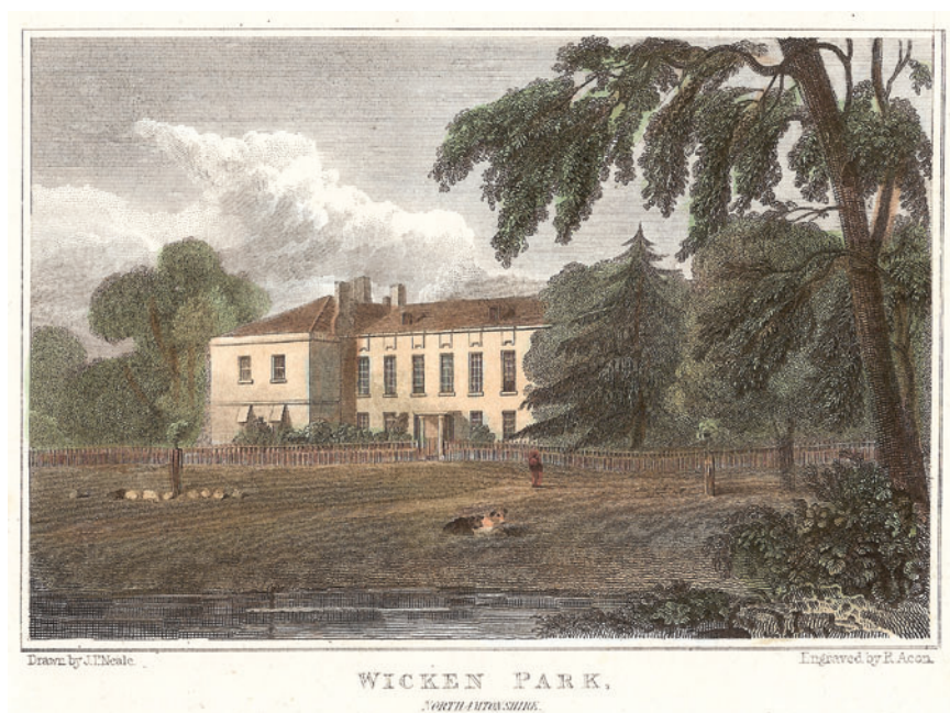
Figure 4.2 Wicken Park, Northamptonshire, by J. P. Neale, 1818.

stoves in the 1770s and early 1780s, as well as installed a water closet supplied by him in 1781. 94