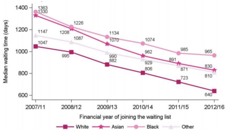
Figure 1: Median waiting time for a kidney as per ethnicity in UK (adapted from ref 10)

white Caucasian patients [9]. Overall waiting time has improved substantially in last decade (see figure 1) and the new allocation scheme from 2019 is expected to reduce further variation based on ethnicity [10].