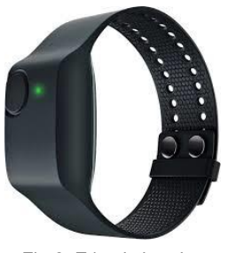
Fig.2. E4 wristband

All sessions were video recorded with two hand-held cameras positioned one in front and one on the side of participants. The video cameras were switched on as soon as participants reached the activity room and were switched off once they left the room after the activity. Each session lasted around 50 minutes, and the activities had a duration of ~20-25 minutes. As a result, we collected ~35 hours of video footage, half of which (~17.5 hours) were of activities. Albeit the presence of cameras can be thought of as a factor that could affect participants' behavior, we noticed that participants stopped paying attention to cameras once the activity started.