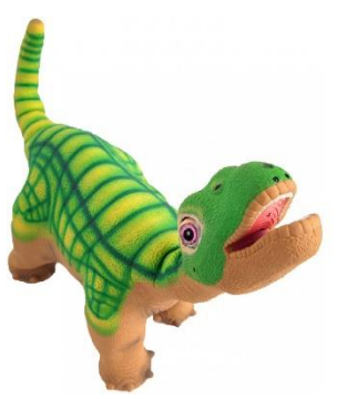
Fig. 1. Pleo, the robotic dinosaur

In the jigsaw puzzles , the couples were asked to collaboratively assembly a set of pieces in a complete picture, usually of an animal. In the shape puzzles , they were requested to wedge a set of shapes, usually in wood, in a board with a series of slots. In the match with the tiles of domino , the players were requested to down a numbered tile from a set of seven that matched the tile on the table. The jigsaw puzzles and the shape puzzles to complete were three. They were presented in a progressive order of difficulty, from the easiest to the most difficult across sessions (see table 1). The challenge of the jigsaw puzzles was customized according to the cognitive level of participants. The right level of challenge for the different degrees of dementia severity was identified in a pilot study. With regard to the dominoes, all couples played one match with dominoes. The order of presentation of the three different board games was randomized using a Latin Squares technique and was always different across sessions (see table 1).