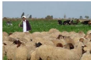
Mixed crop-livestock systems in the El Hammam region (V. Alary)