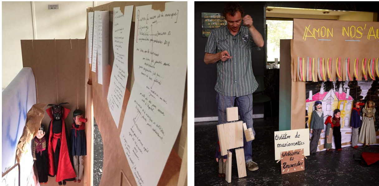
Figure 4 - Seraing, May 2015 - Images from the puppet play.