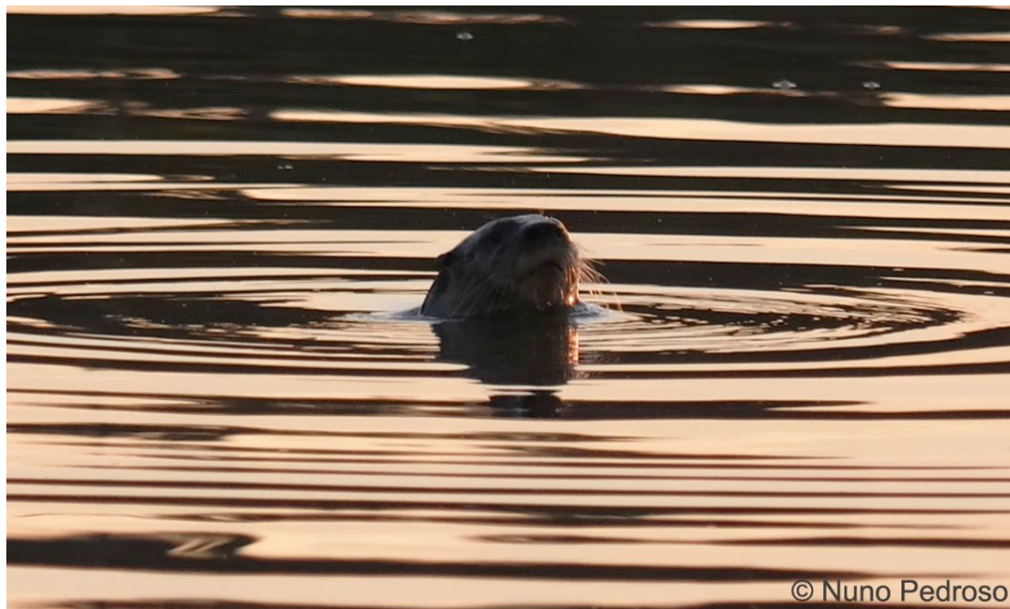
Figure 7. Neotropical otter observed in Paranapanema river.

Besides talks, six meetings were promoted with stakeholders and local decision makers including mayors, city councilmen and Federal deputies. In the course of these, they were informed about the environmental concerns identified during the course of our work and discussions followed on possible future actions to diminish environmental degradation in the region. Occurrence of antimicrobial resistance in aquatic environments is an important concern of public health, since aquatic environments are used by local inhabitants in their daily tasks (e.g. fishing, transport, leisure, urban use). Several stakeholders and representatives of local governments became especially interested in this matter as they have been informed about how the use of not only antibiotics, but also insecticides and fertilizers may affect aquatic environments and human health by excessive use, runoff from facilities and cattle defecation in rivers. Interest was also shown on further discussions on how to