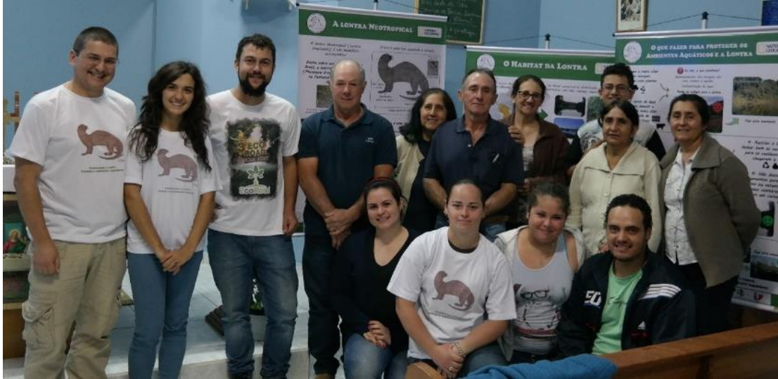
Figure 4. Project members and attendees of a talk in Leites village, near Angatuba city.