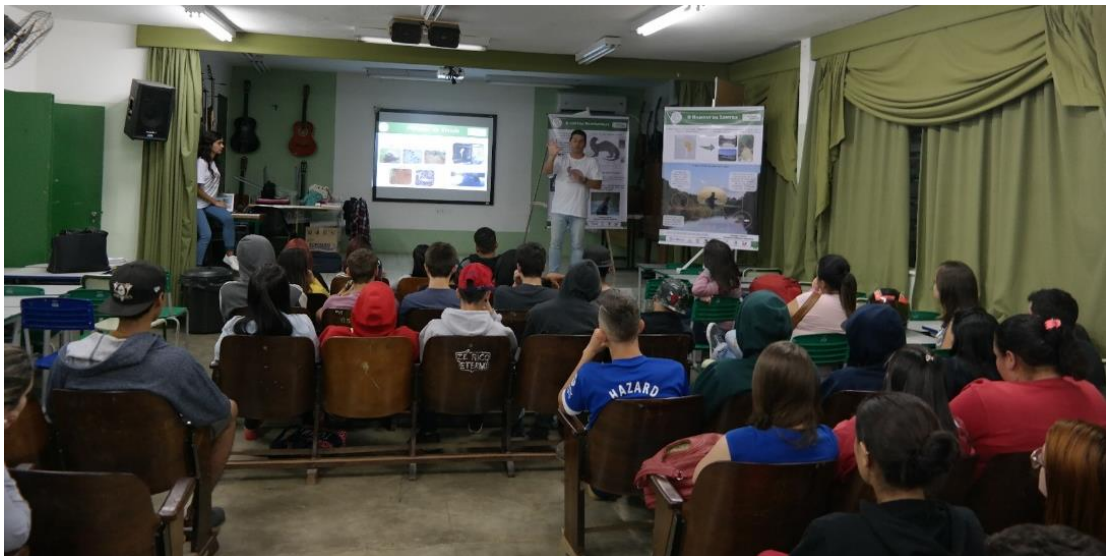
Figure 5. Talk in Ivens Vieira State School, Angatuba.

In each event, attendees also provide us information about specific areas where the riparian vegetation is decreasing and new threat factors such as the appearance of non-native species of fish that are competing with native ones, unbalancing fish communities.