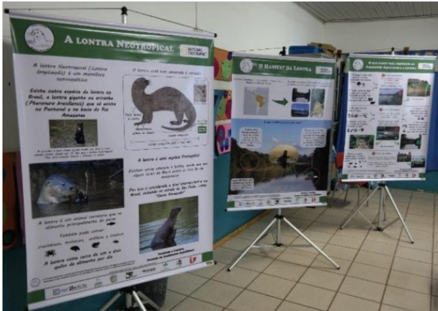
Figure 3. Banners (from left to right: The Neotropical otter, Otter habitat, Good practices towards aquatic environments).

The distributed handouts indicated a list of actions to mitigate further water contamination and pollution, riparian degradation and encourage the recycling of urban waste and the collection of medications and drugs that are no longer used by the population.