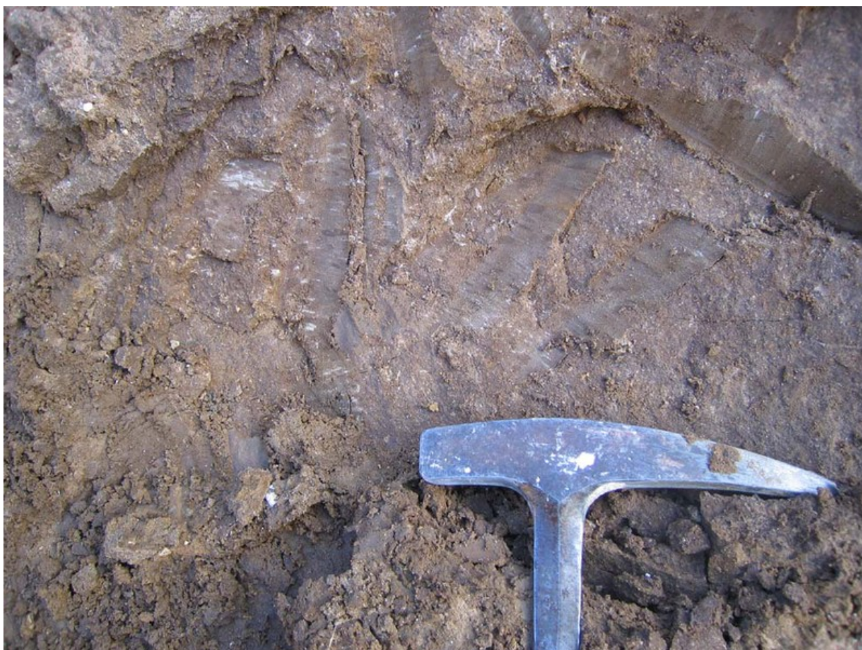
Figure 3. Rootlet traces in the basal Reading Formation, Alum Bay (P692184).

Post depositional pedogenesis has formed mineralised silcrete and calcrete ‘hard bands’. The clay often has a blocky texture defined by numerous discontinuities formed as the result of repeated expansion and contraction during periods of subaerial wetting and drying.