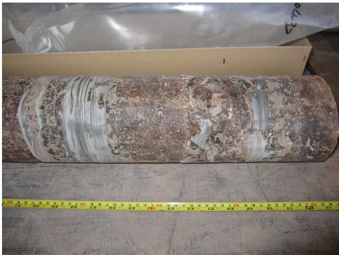
Figure. 2. Core from Northwich Victoria Infirmary Borehole (SJ67SE/137), Triassic Northwich Halite Formation. Interlayered mudstone and halite (P749044)