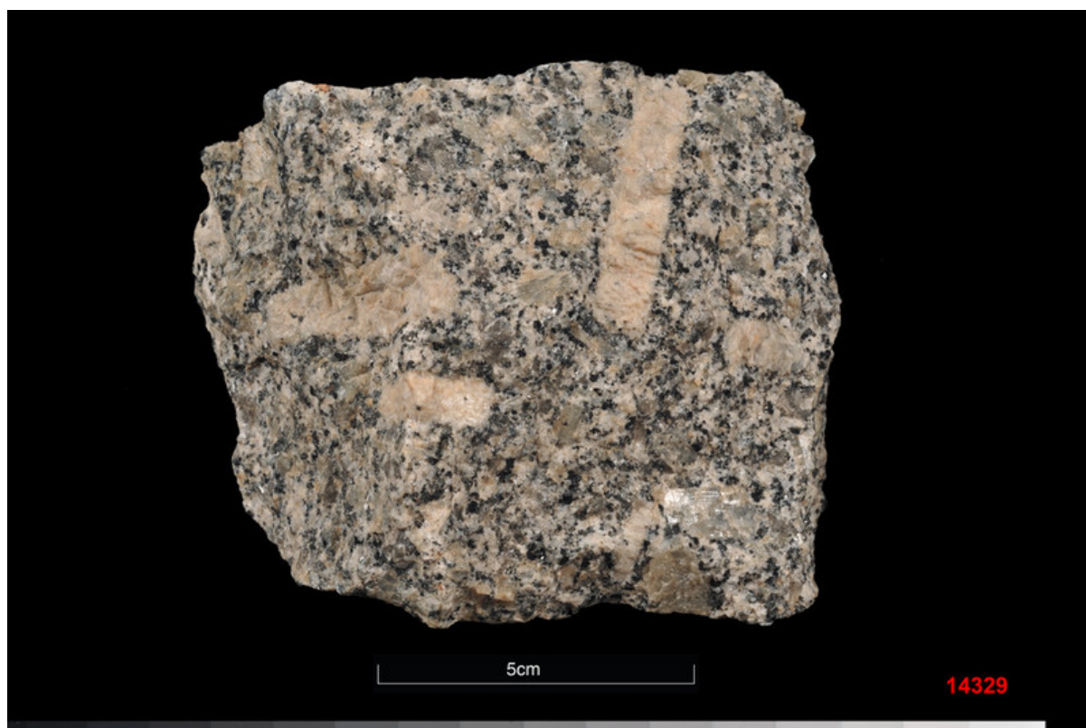
Figure 10. Example of alkali-feldspar megacrystic granite from the Cornubian Batholith (P751221).

Intrusion was accompanied by thermal metamorphism in the sedimentary host rock as well as widespread pegmatite veining and hydrothermal alteration that largely controlled the location and species of economic metalliferous and china clay mineralisation. Jointing is well developed in the pluton and is also often mineralised. Together these features record a history of high to low temperature fluid-rock interaction including interaction with ‘modern’ saline groundwaters (Edmunds et al., 1984). Records of saline thermal waters (up to 45 °C) entering the excavated tin mines of Cornwall, some within the granite, show evidence of deep fracture-borne flow.