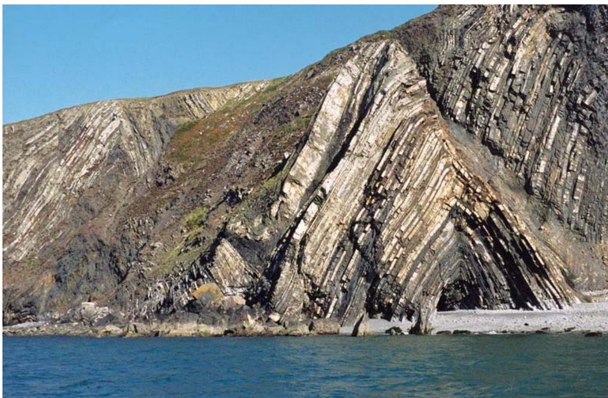
Figure 7. Folded succession of interbedded very low grade metasandstone and metamudstone from the Cardigan Bay coast (P662414).

The Cwmystwyth Grits Group largely comprise quartz-rich sandstone with subordinate alkali feldspar clasts and detrital illite or chlorite. Some variants, termed ‘high matrix sandstone’ are dominated by detrital chlorite and illite and may have matrix-supported textures. During regional deformation and very low grade metamorphism the metasandstones have developed slaty cleavage microfabric and typically quartz has remobilised and recrystallised to reduce the original porosity. The intergranular permeability of the Cwmystwyth Grits is minimal and water movement and storage is controlled by the degree of fracturing and fracture connectivity which is heterogeneous at all scales (Shand et al., 2005), however the amount of fracturing is greatest in the shallow part of the formation due to weathering. Cleavage planes typically have a cm-spacing and in many beds, pressure solution in cleavage planes has given rise to irregular apertures and voids. Propagation of other fractures including veins and joints is also common, and tectonic shortening of the multi-layer successions typically gives rise to intense folding on km- to m-scale so that beds are typically moderately-inclined to sub-vertical.