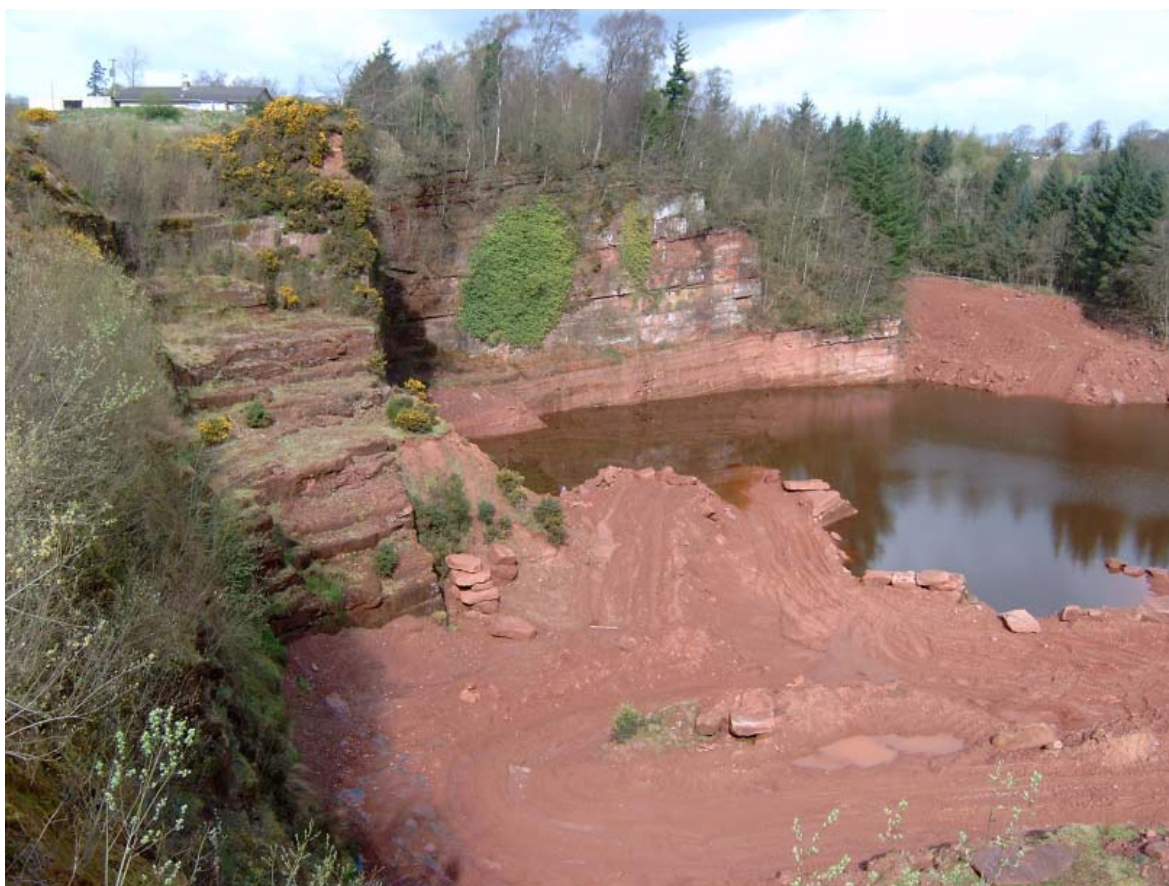
Figure 6. St Bees Sandstone Formation showing sheet sandstones near the base of the quarry overlain by channelised sandstones (P621360).

Diagenesis includes precipitation of authigenic minerals and cements in pore spaces and fractures including anhydrite, calcite, dolomite, haematite, barite, kaolinite and illite clays (Milodowski et al., 1998). The current 3.7-27.2% porosity in the formation is considered largely secondary and attributed to dissolution of carbonate by modern groundwaters (Allen et al., 1997; Strong et al., 1994). Permeabilities measured on core samples and in boreholes range from below 10^{-2} up to 10^3 mD (Bloomfield and Williams, 1995; Chaplow, 1996). These values are however several orders of magnitude less than field values derived from pumping tests.