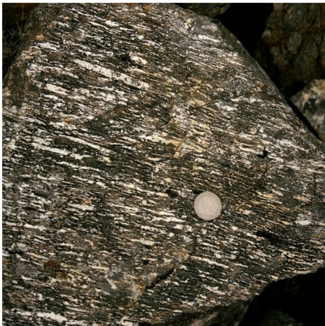
Figure 9. Silicified welded ash-flow tuff with prominent fiamme, Snowdon Volcanic Group (P213433).

Under conditions of very low grade metamorphism (Roberts and Merriman, 1985) clay minerals from devitrified vitric matrix recrystallised to form sericite-chlorite cleavage.