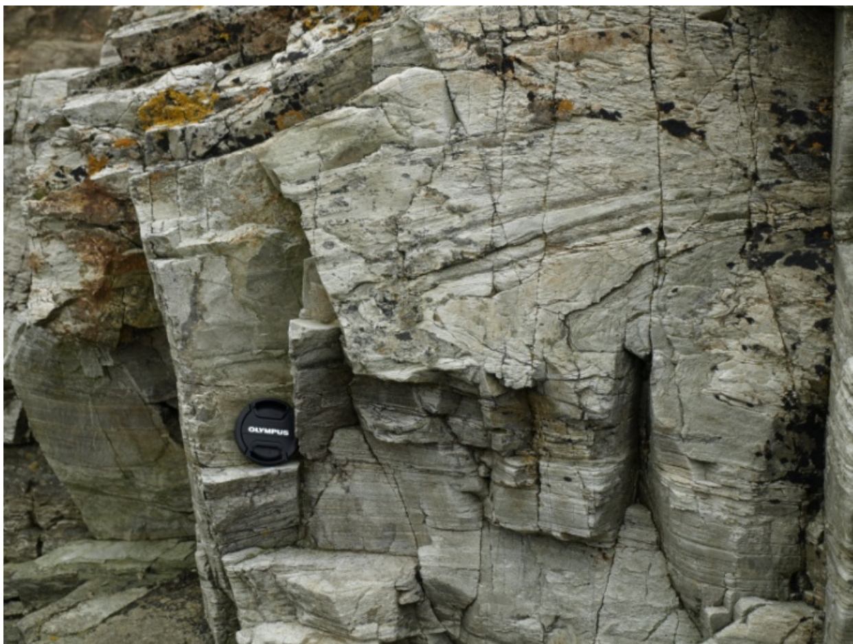
Figure 11. Tectonic folds in psammitic metasedimentary rock, Anglesey.

In England and Wales metamorphic rocks are known only from a limited number of exposures of Neoproterozoic rock which tend to occur adjacent to significant fault zones. More extensive exposures are present in the north-east of Northern Ireland. For example, the Mona Complex of Anglesey (Greenly, 1919) comprises a number of dominantly metasedimentary units of contrasting composition. These include sparse exposures of biotite-garnet-sillimanite gneiss representative of metamorphism of sedimentary protoliths under high amphibolite facies conditions (Carney et al., 2000); thinly interlayered psammitic (quartzofeldspathic) and pelitic (mica-rich) metasedimentary schists that locally preserve sedimentary features (Figure 11); lenses of metamafic rocks with distinctive barroisite and glaucophane-bearing blueschist facies mineral assemblages (Dallmeyer and Gibbons, 1987).