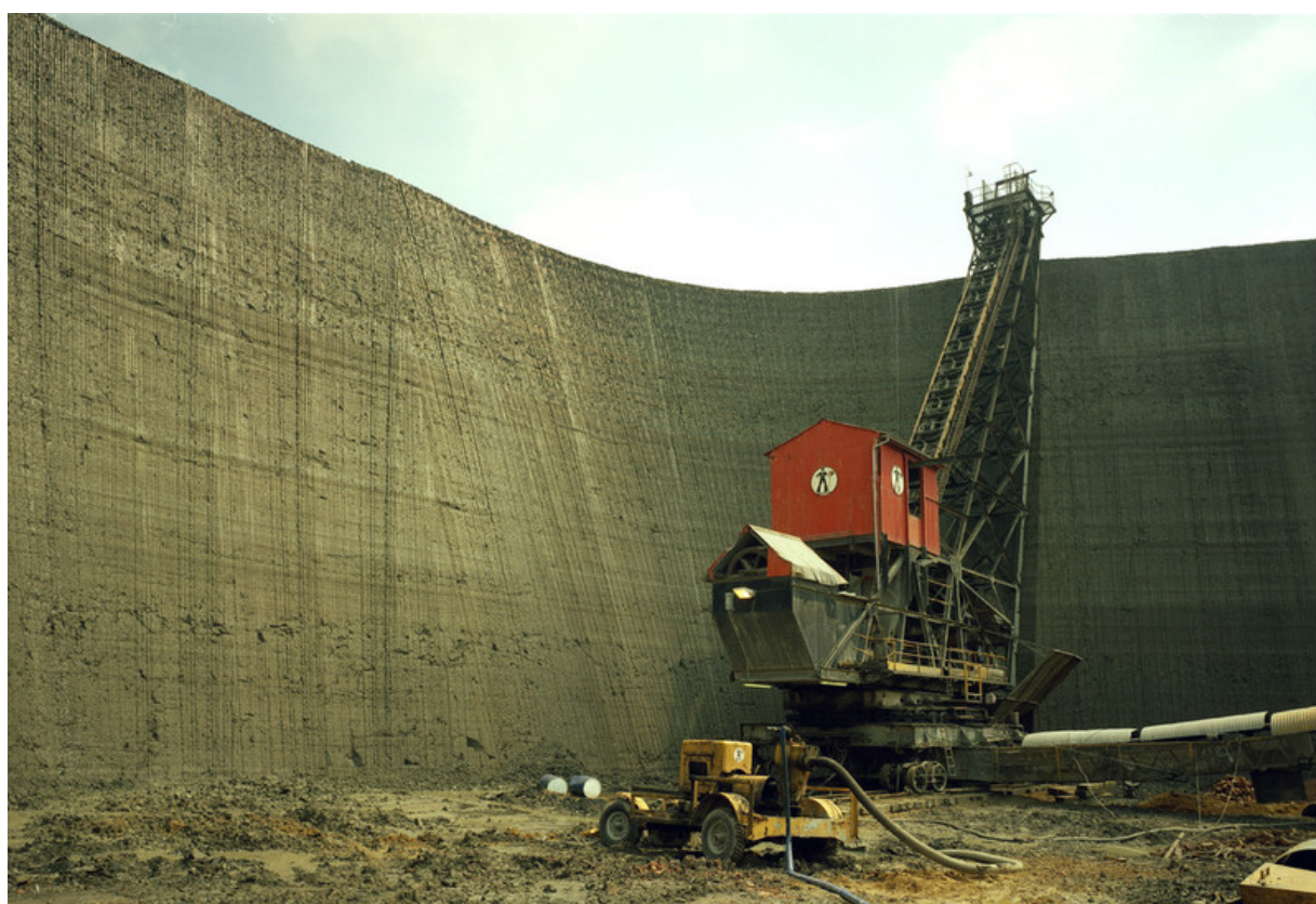
Figure 4. King's Dyke Pit, Whittlesey, near Peterborough. Excavation in Peterborough Member of the Oxford Clay Formation (P802440).