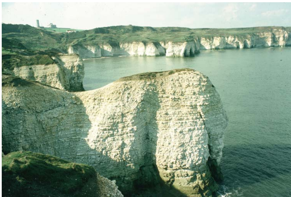
Figure 8. Chalk cliffs at Flamborough Head (P006782).