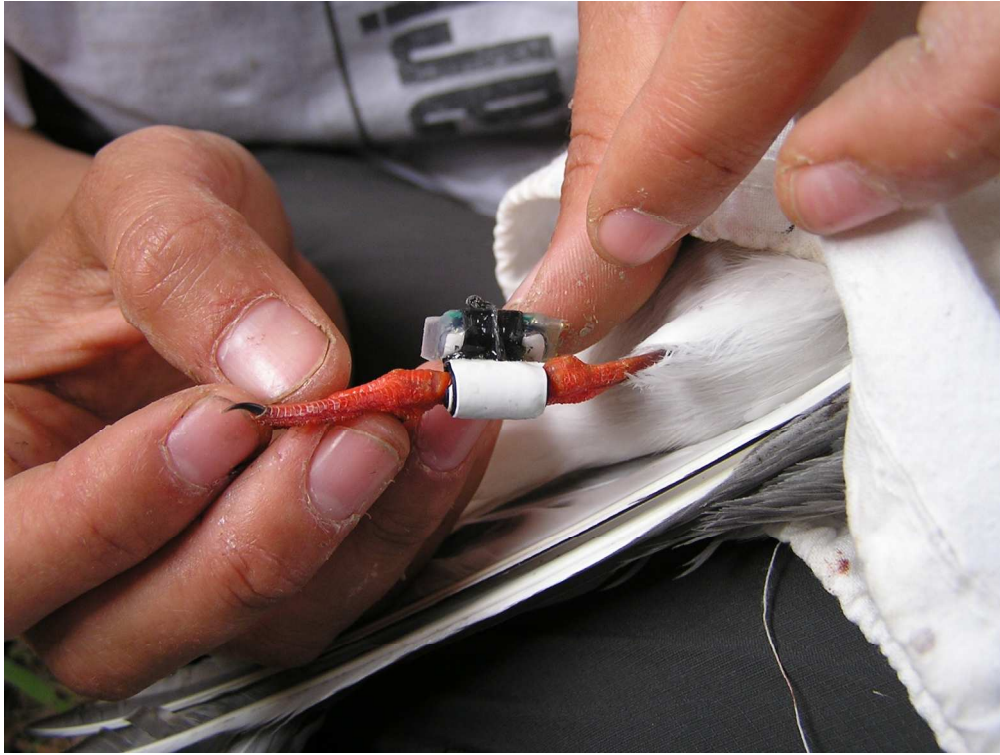
Figure S1: Leg of a Common Tern ( Sterna hirundo ) showing the Mk10 geolocator deployed on a darvic ring. 722x541mm (72 x 72 DPI)