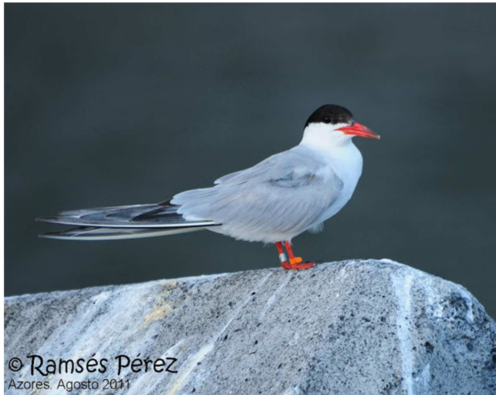
Figure S2: Picture of a Common Tern ( Sterna hirundo ) resighted in Lajes do Pico (Azores) in August 2011 and originally ringed in Punta Rasa (Argentina). 225x178mm (72 x 72 DPI)