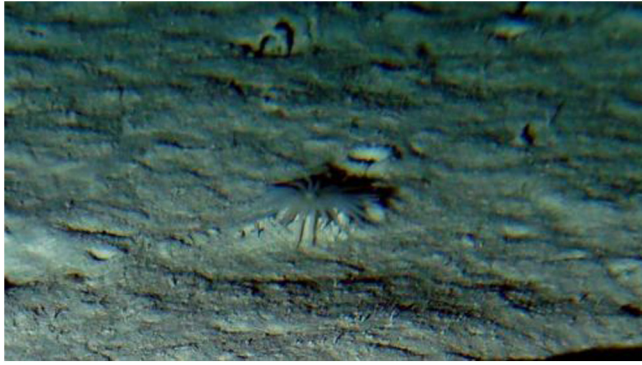
Video S1. Complete oblique photographic sequence of subsurface burrowing activity by Losactis vagabunda shown in Fig. 1b. Images were captured at 20-min intervals, and are shown at 1 second intervals in the video. A video clip is available online. Supplementary material related to this article can be found online at doi:10.1016/j.dsr.2015.04.010.