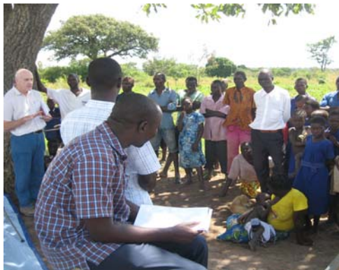
Photograph 1. Well point community discussions in Amuria District