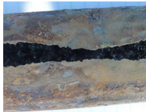
Photograph 2. Perforation of a rising main from corrosion