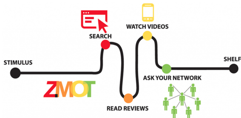
Figure 1. "The Zero Moment of Truth" - Google

Chen and Xie (2004) observe customer online reviews as a new element of marketing communication mix that has a growing importance in contemporary communication. Other authors observe social media as a "hybrid element of promotion mix" due to the fact that they provide companies with the opportunity to conduct direct and interactive communication with customers, while allowing customers to establish mutual communication and share information with each other (Mangold, Faulds, 2009). Furthermore, organizations have realized that conducting advertising activities on social media is far more cost effective as it allows expanded message reach, which is disseminated as a consequence of user activities rather than buying expensive traditional media space.