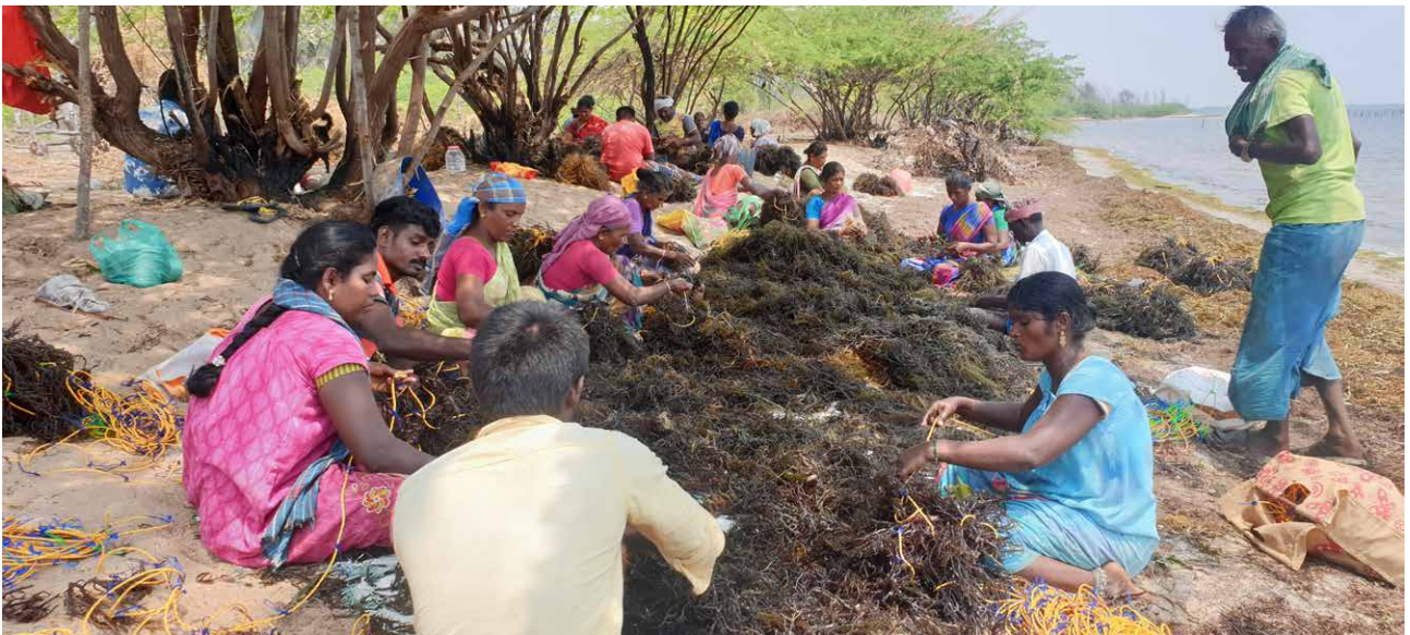
Fig.4. Beneficiaries actively involved in seeding the ropes

fresh seaweed was harvested. The fresh seaweeds were utilized for expanding 400 monoline units under the project. An amount of Rs. ₹96,000 was generated by the beneficiaries under the project as their revenue (₹13,500 per beneficiary). The third crop was initiated during the last week of February, 2020 with seven groups. As an impact of 'total lockdown' due to COVID -19 pandemic, the beneficiaries decided to undertake partial harvest and to continue the farming with remaining seaweed. The harvest was made during the first week of April, 2020. Around 2,648 kgs of dry seaweed (26,480 kgs