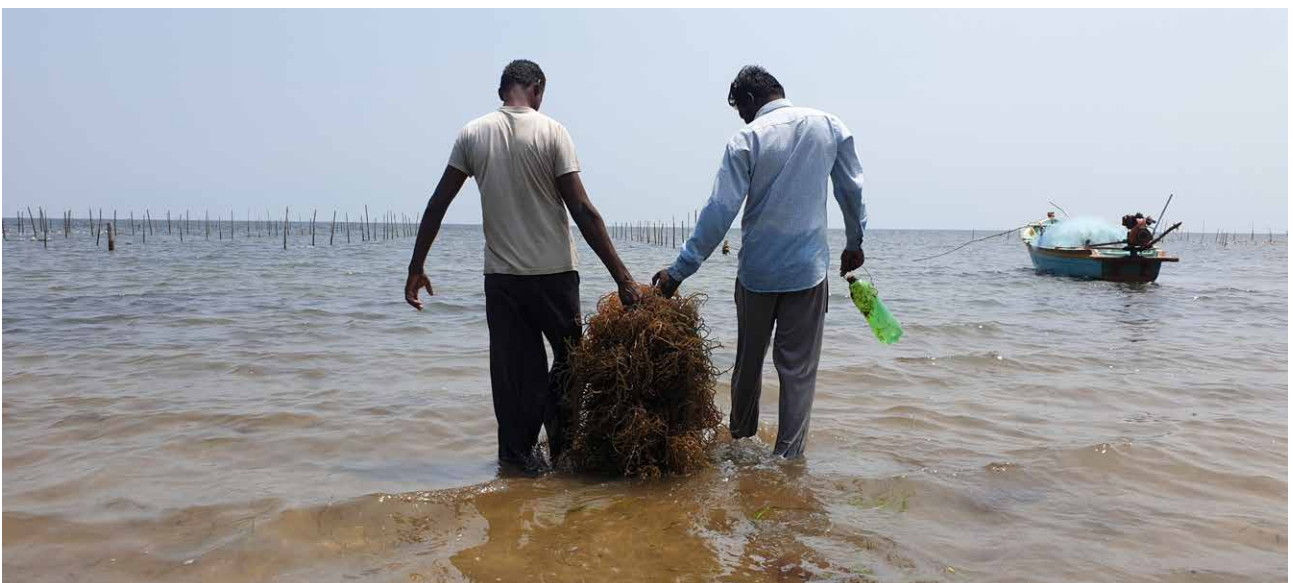
Fig.5. Taking the seeded ropes for tying on the poles