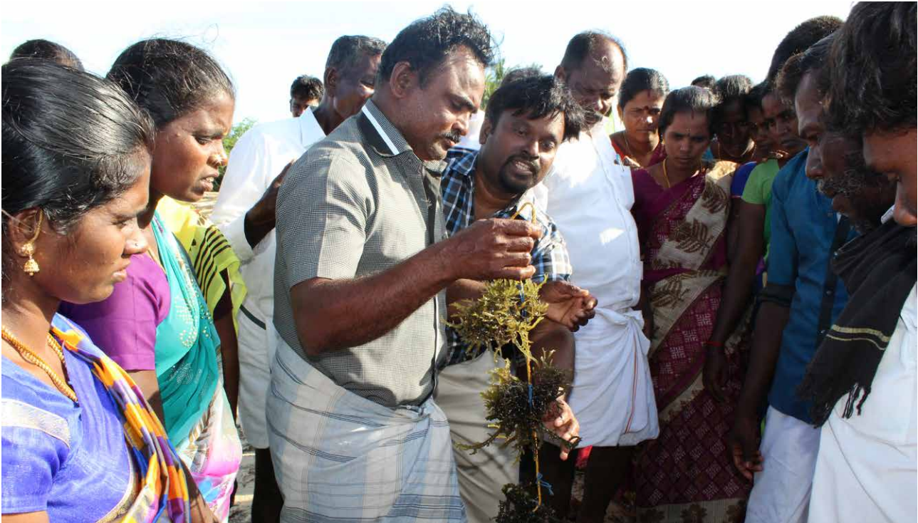
Fig.2. Training programme on “Mariculture Technologies for Diversified Livelihood”

10 × 20 feet distance each in the corner. On four sides 6mm rope was tied, on which the seaweed seedling rope was tied. A total of 10 polypropylene-twisted ropes were used for planting. Around 150 – 200 grams of seaweed fragments were tied at a spacing of 15 cm along the length of the rope. A total of 40 seaweed fragments were tied in a single rope. The total seed requirement per raft was 60 – 80 kg per monoline unit. One segment (120 feet length and 20 feet breadth) constitutes 10 monoline units (Fig.3). HDPE fishing net was used for making fencing for avoiding grazing by fishes in the sea and drifting away of the seaweed seeded nets. Used PET bottles were tied on each rope for increasing the floatability. Inputs for farming the seaweeds were provided