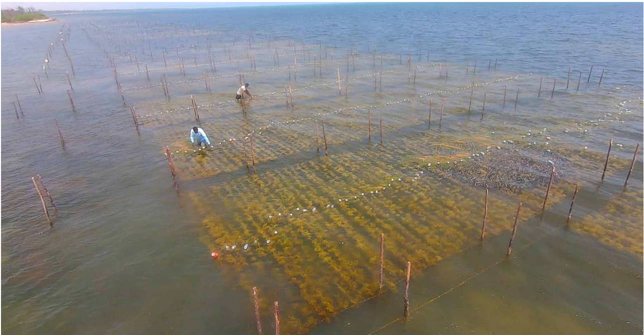
Fig.7. Aerial view of the seaweed farm, Puthukudi village, Thondi

wet weight equivalent) was sold and ₹1,27,104 was generated by the beneficiaries as their revenue amounting to ₹6,500 per beneficiary (Figs. 4-8). The projections for the future harvest of seaweeds under this programme in a cycle of 45 days with 20 monoline units per fisher appear to be good assuming that 8-9 months will be the crop period in a year depending on the climatic conditions (Table 3).