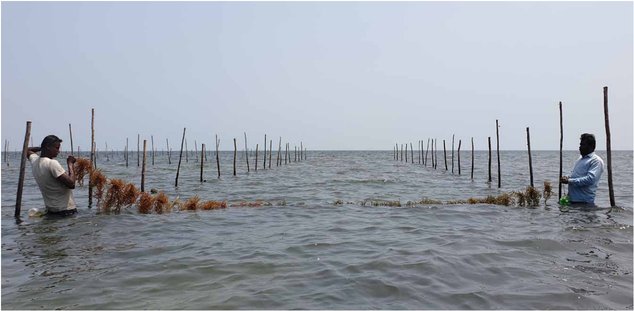
Fig.6. Seeded ropes tied on the pole