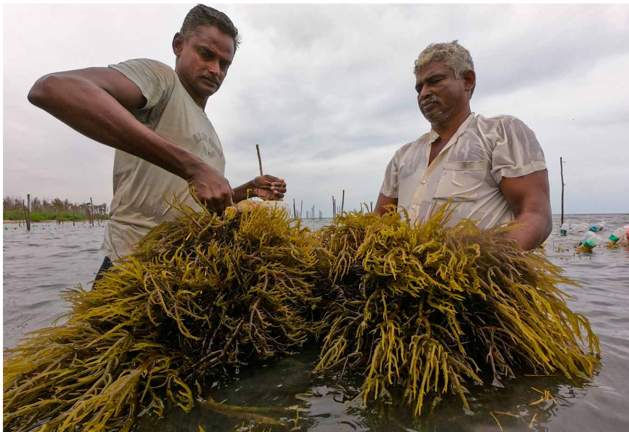
Fig.8. Ropes ready for harvest after 45 days

Since entire cost is met under the SCSP, each fisher can earn around one lakh rupees annually or about ₹10,000 per month. This is the first Government enabled livelihood improvement initiative for fishers in the Puthukudi village and beneficiaries expressed happiness that the income through seaweed farming will be very useful in improving their standard of living .