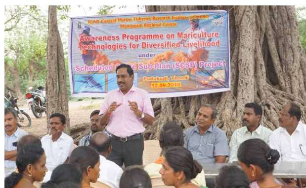
Fig. 1. Awareness creation on mariculture technologies and SCSP

Monoline method of seaweed farming was adopted as the Puthukudi coastal area had low wave action, shallow depth and less herbivorous fishes which are ideal for monoline method of seaweed farming. Four casuarina poles of 10 feet length and 3-4” diameter were placed at