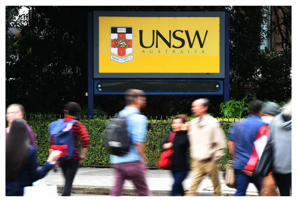
Higher education fees are loaned on the basis the debtor doesn't have to repay until they can afford to.