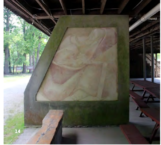
14 Detalle de uno de los frescos pintados por Jean Charlot durante su visita al Studies Building en el verano de 1944. / Detail of one of the frescoes painted by Jean Charlot during his visit to the Studies Building in the summer of 1944.