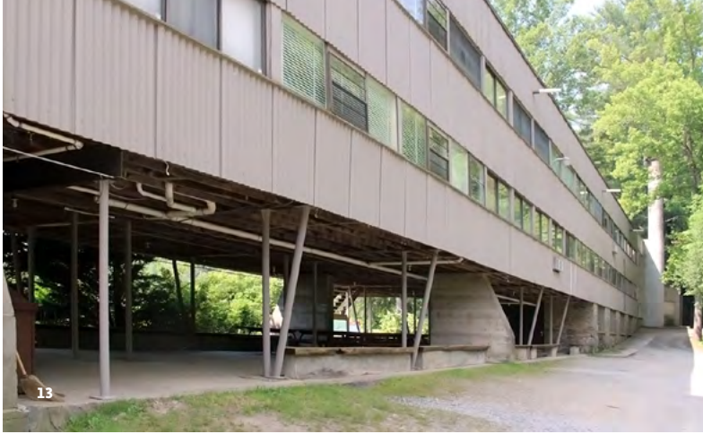
13 Estado actual del Studies Building . / Current status of the Studies Building . © Gilsanz, Gutiérrez, Parra, 2016