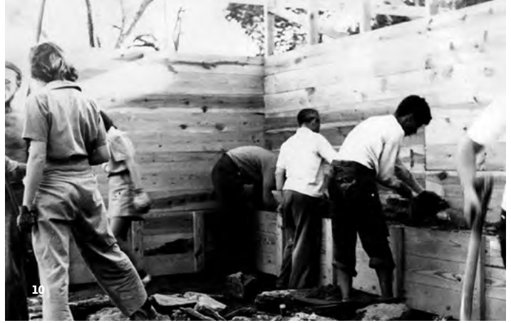
10 Estudiantes trabajando en las obras del Studies Building en Lake Eden Campus, 1940-41. / Students working on the Studies Building's construction in Lake Eden Campus, 1940-41.

validating its agenda, the BMC never stopped operating on the margins of what was instituted.