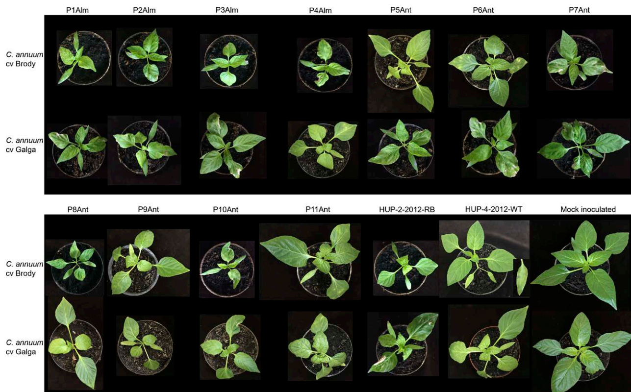
Figure 1. Host symptoms of the isolated TSWV strains mechanically inoculated on resistant ( Capsicum annuum cv. Brody) and susceptible ( C. annuum cv. Galga) pepper cultivars.

using the Mega 7.0 software (Kumar et al. , 2016; Nei and Kumar, 2000) (Figure 2). The different pepper strains of TSWV retrieved from the GenBank (Table 2) and the strains isolated in the present study clustered in two main clades. Clade I built up of Spanish, Northern Italian and two Brazilian (RB and WT) strains, while Clade II consisted of strains from Southern Italy, Hungary, France and Korea (Figure 2). Consistent with previous studies, sequences of the pepper strains of TSWV clustered according to their geographic localization (Kim et al. , 2004), although this could evolve due to host and environmental factors (Jiang et al. , 2017). Except for one strain (P1Alm ESP), the isolates collected in the present study from Spain did not cluster together with previously collected Spanish isolates (Clade I), but they were located in Clade II, close to the South-Italian and Hungarian strains (P2Alm ESP, P3Alm ESP, P4Alm ESP). The strains collected from Turkey also clustered into different main clades. Except for one strain (P5Ant), the Turkish isolates were located on Clade I (P6Ant TUR, P7Ant TUR, P8Ant TUR, P9Ant TUR, P10Ant TUR, and P11Ant TUR). The P5Ant TUR isolate was located on Clade II, close to Spanish isolates characterized in