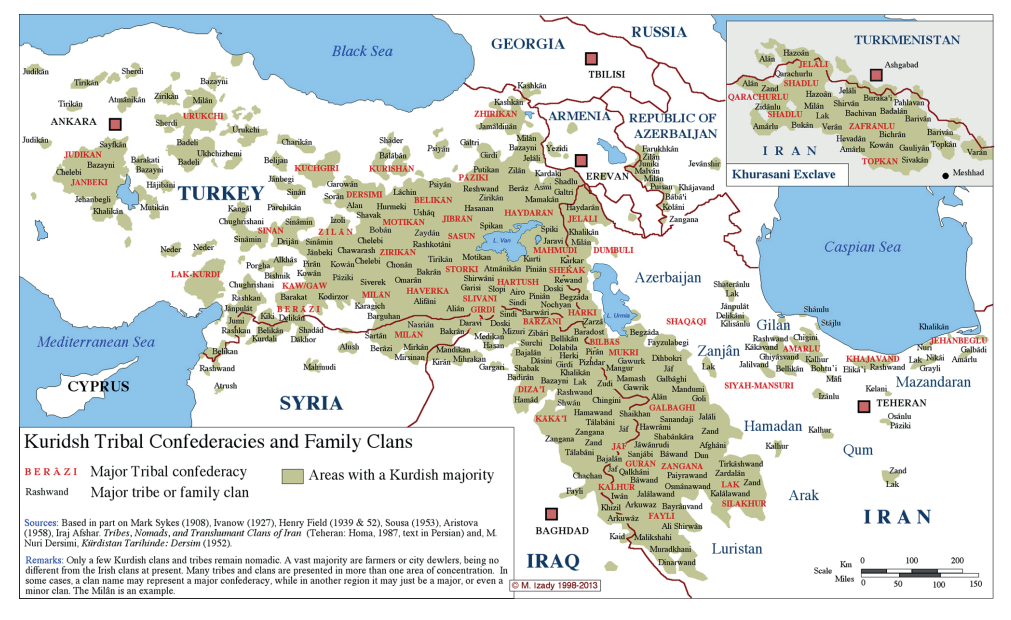
Map 1 Kurds in the Middle East<sup>2</sup>

Rojava, West in Kurdish, is the colloquial name to describe the de facto autonomous region in Northern Syria, officially called Rojava–Democratic Federation of Northern Syria. The territory is the southward extension of the Kurdish populated area in Turkey.<sup>1</sup> Kurds, who number around 30 to 40 million, are deemed to be the biggest nation on earth without a state of their own.