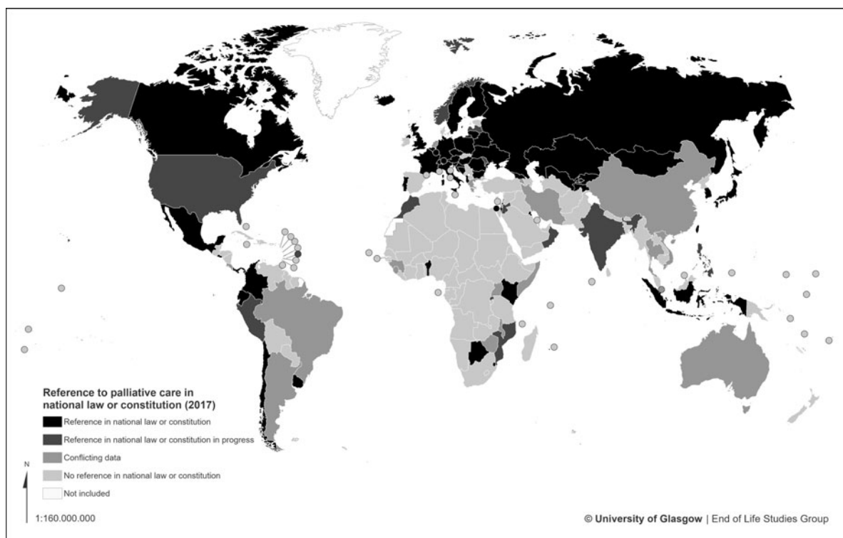
FIG. 3. World map of palliative care in national law.

palliative care strategy, reference to palliative care in a national law, or a dedicated individual or unit within government responsible for palliative care are in the high- or upper-middle-income categories. Nevertheless, there are also a number of relatively poor countries with these elements in place (Table 4).