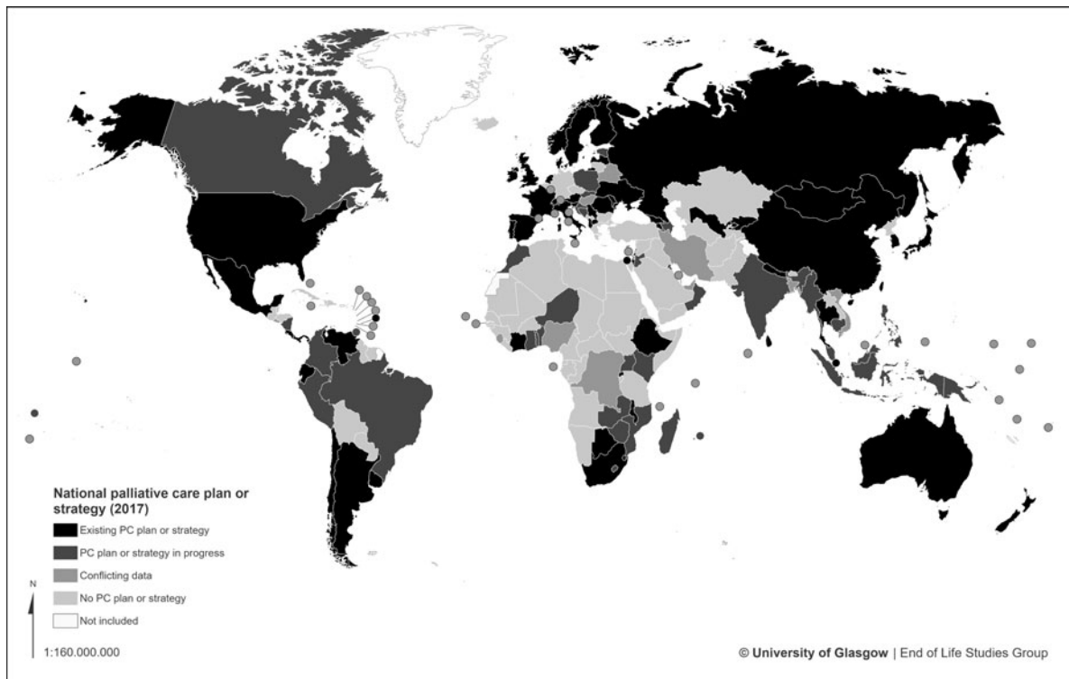
FIG. 2. World map of national palliative care strategy development.

for palliative care is reported in 66 countries, a third (33%) of the global total. In three countries work toward this is underway. Responses from a further 15 countries provide conflicting assessments as to whether or not this support exists (Fig. 4 and Table 3).