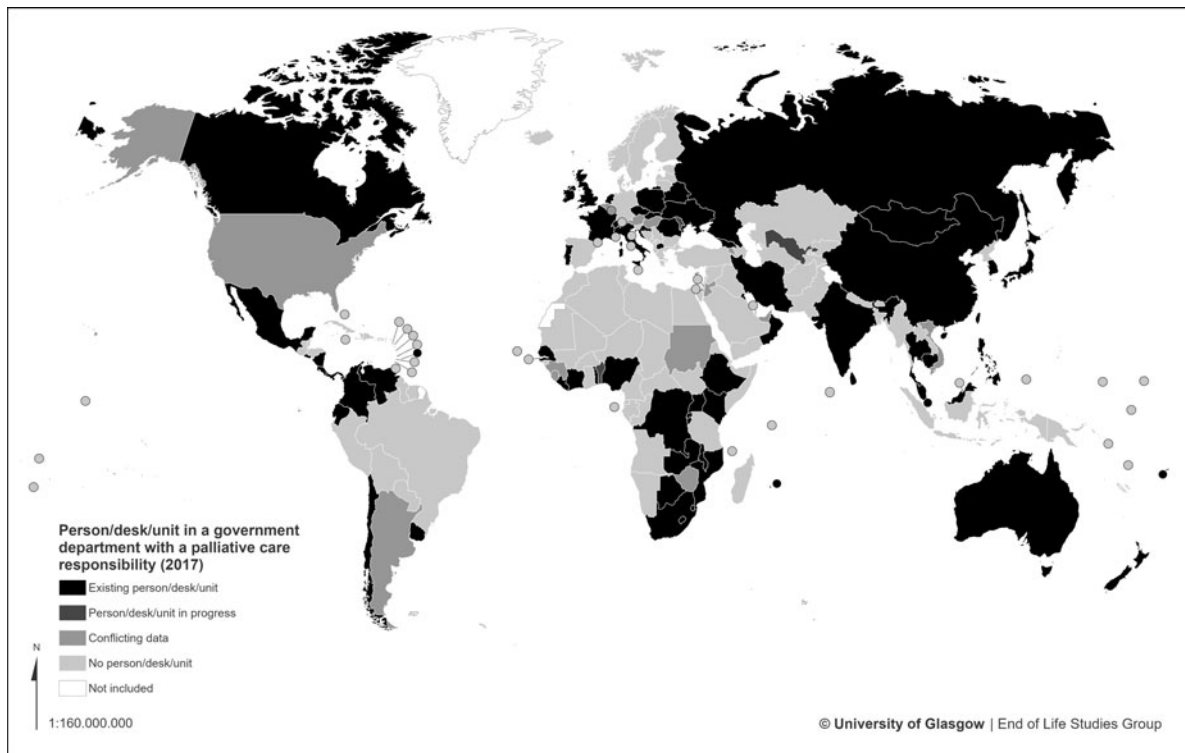
FIG. 4. World map of government palliative care resource.

have more decentralized systems of governance or high levels of regional autonomy related to health care provision, a focus on national policies may conceal significant within-country variation in the development of palliative care policy. Third, some specific items we used may provide only limited insights. For example,