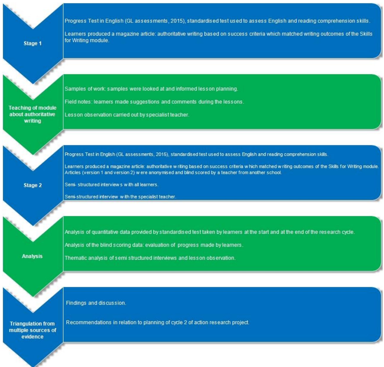
Figure 2 - Cycle 1: data collection stages