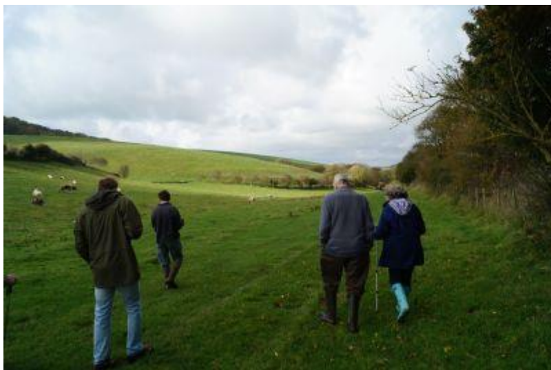
Figure 4: The participants in case study 3 during the site visit.

This case study was proposed by a local resident after case study 1, which I pursued as a truly community-led project. They wanted to date a well-known field system in the Valley of Stones (see Figs 1 and 4). I had hoped that this would be a collaborative