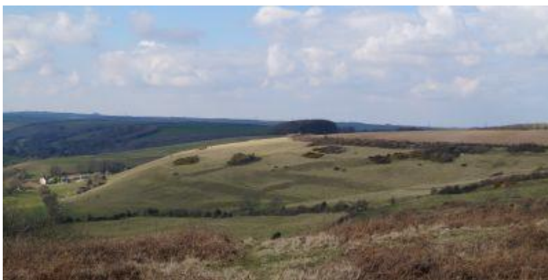
Figure 5: Valley of Stones field system.

The Valley of Stones is a Scheduled Ancient Monument (No. 1002431) . It contains significant upstanding earthworks that are predominantly field systems (both prehistoric and later) but also include hut circles and other enclosures. The team initially proposed that the project would try to date the field systems using environmental coring and radiocarbon dating. I expressed a concern that this might not be possible; not only would