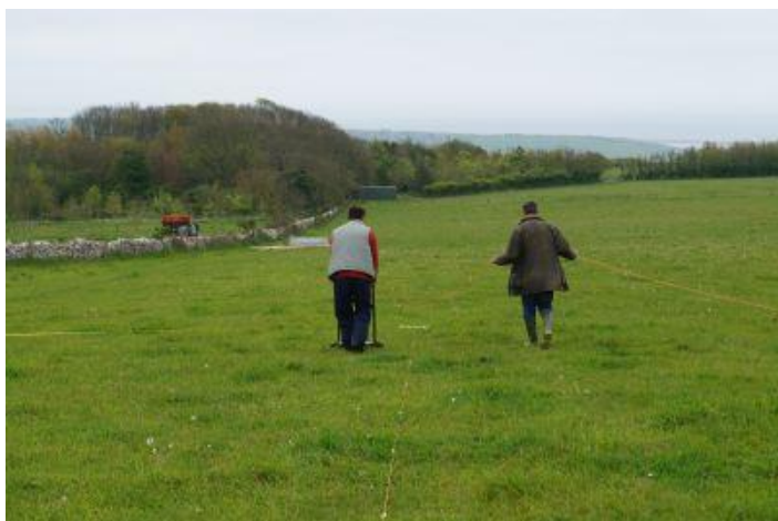
Figure 2: Case study 2: conducting resistivity survey.