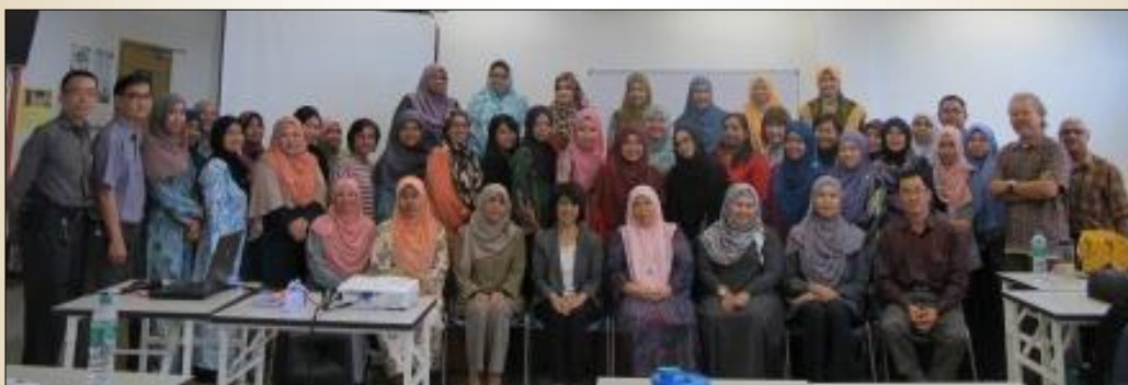
The participants and the facilitators posing for a group photo