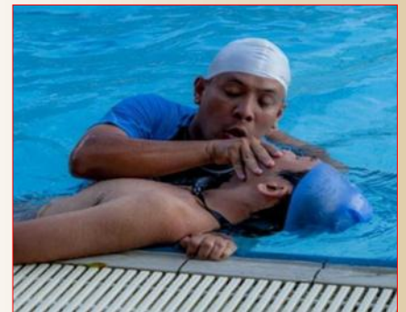
Our coach demonstrating the towing and doing mouth to nose resuscitation.