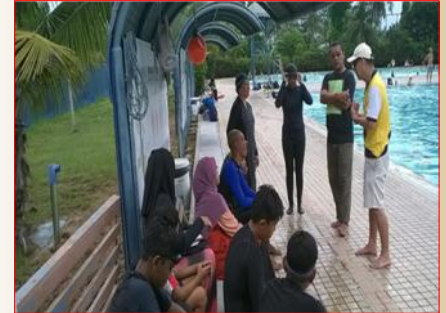
Listening to the examiner before the exam started.