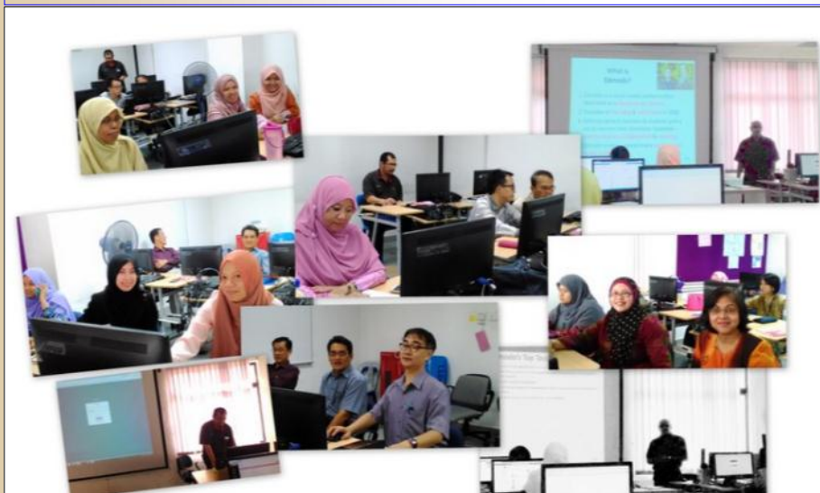
A montage of the 'goings-on' during the Edmodo workshop