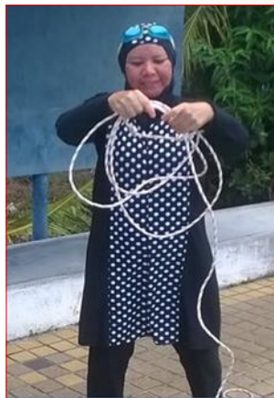
Throwing rescue with a 15-metre rope; the rope must be straight upon throwing. If it entangles, the rescuer will fail the test.