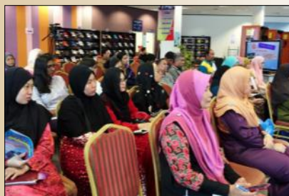
Some of the participants at the workshop