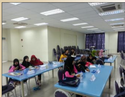
Sebahagian pelajar dari Krabi yang mengikuti program 'Summer Camp'

(Sila lihat ms 16 untuk jadual perbendaharaan kata)