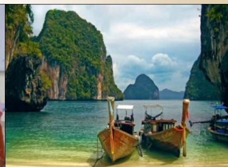
Krabi dengan pemandangan menawan kalbu