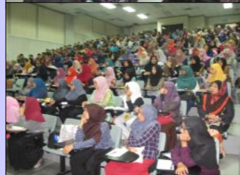
The hall was packed with students who had come to 'know more'