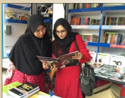
The author and her colleague browsing through some of the materials at the workshop