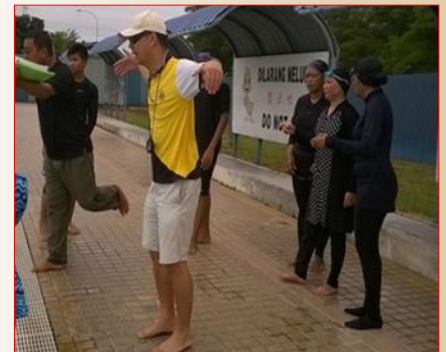
Waiting anxiously for my turn to do a rescue discipline.