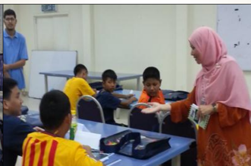
Penulis cuba mendapatkan respon daripada seorang peserta